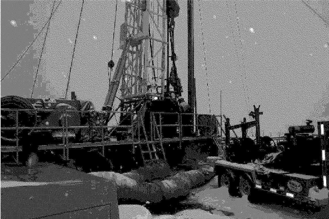
Diamondback Energy Rig