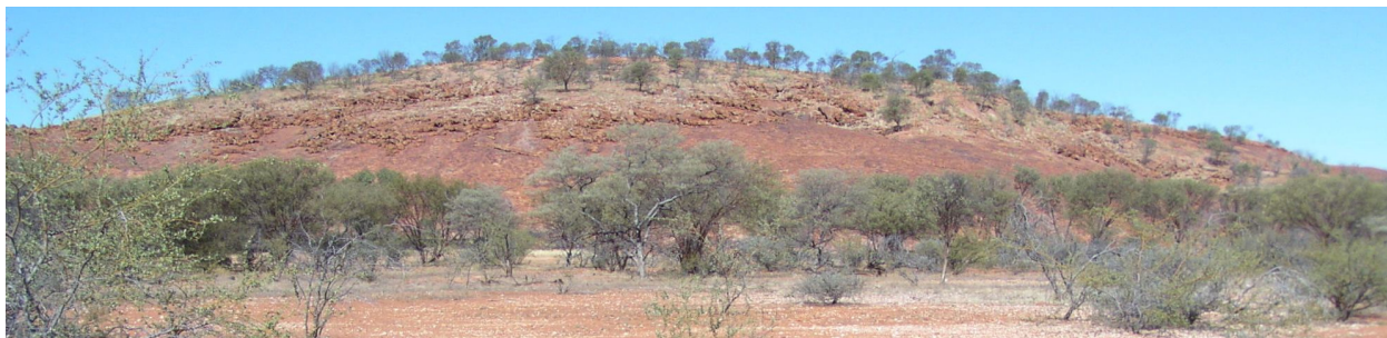
Figure 1: Red Rock, a granite inselberg, contains surface rock chip assays up to 946ppm Uranium

Field investigations were carried out by the Company's uranium-specialist geologist, Syd Morete, and included footborne scintillometry and rock chip sampling. The strongest ground radiometric anomaly was located on top of the rock.