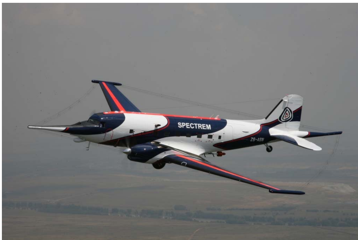
Figure 1. Anglo American's proprietary "Spectrem" EM system.