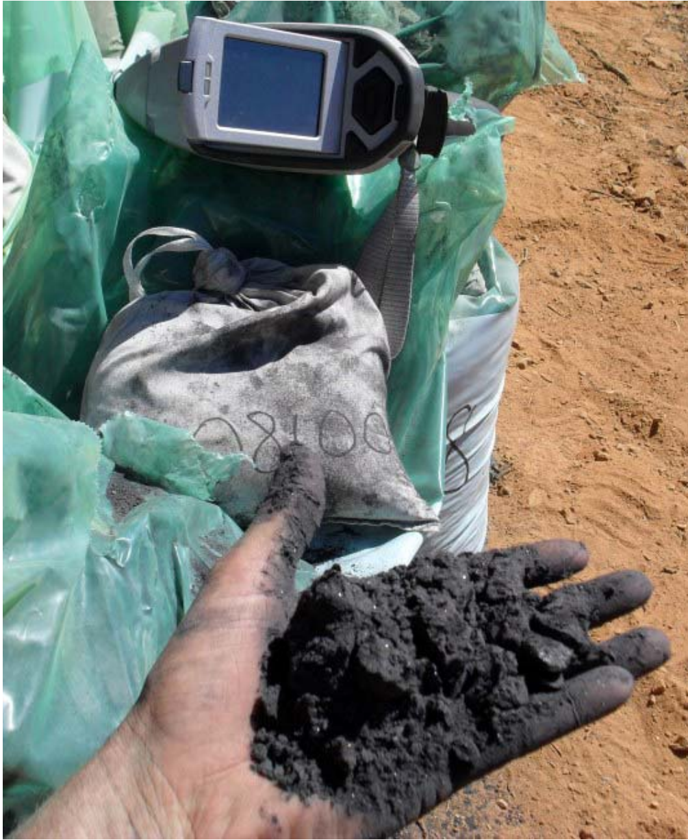
Figure 2 Coarse Magnetite RC drill cuttings from Mt Ida