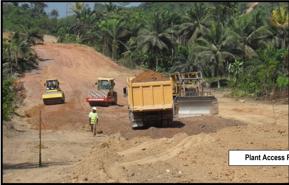
Plant Access Road