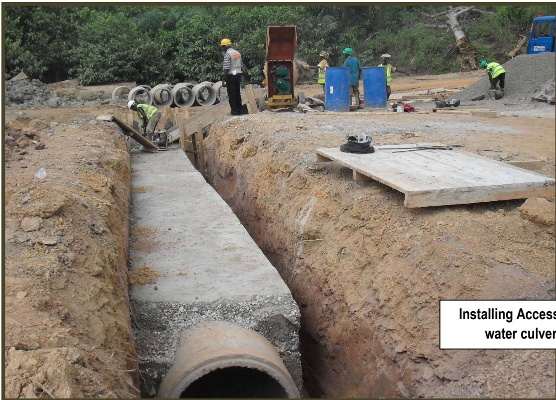
Installing Access Road water culverts