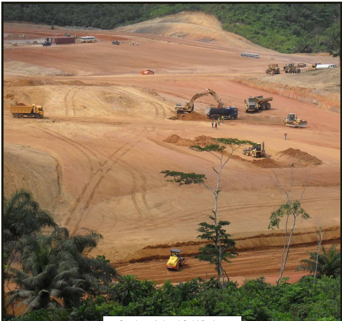
Southern Ashanti Gold Project - Plant Site

The following photographs are current to 23 January 2010 and are included on the company's website http://www.adamusresources.com.au/index.php?option=com_content&task=view&id=277&Itemid=104