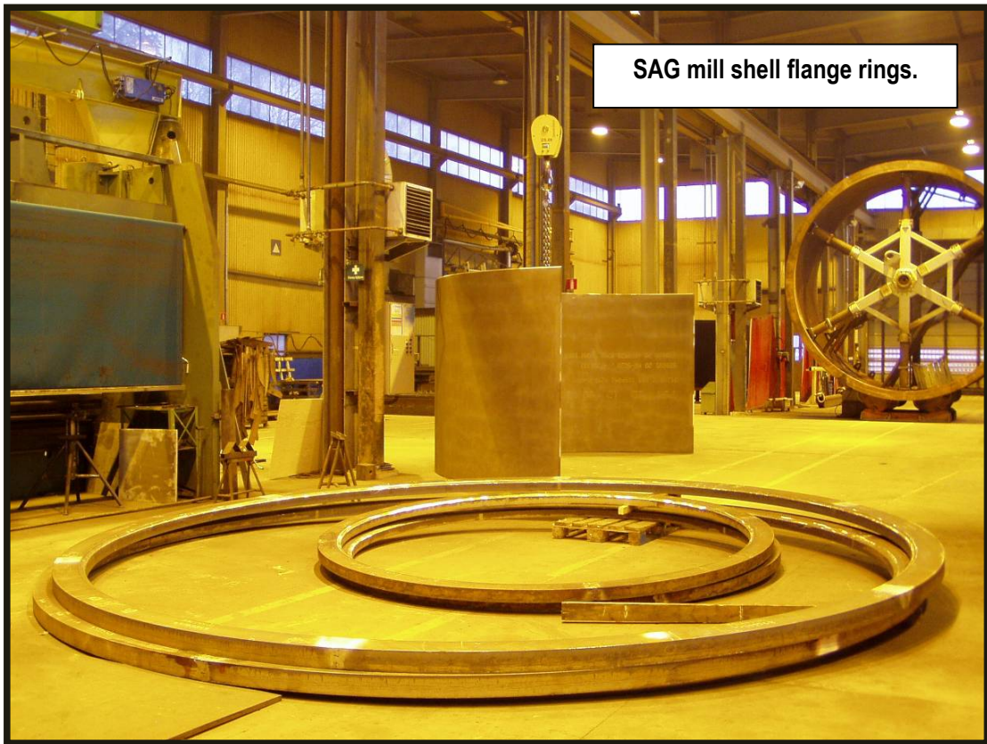
SAG mill shell flange rings.