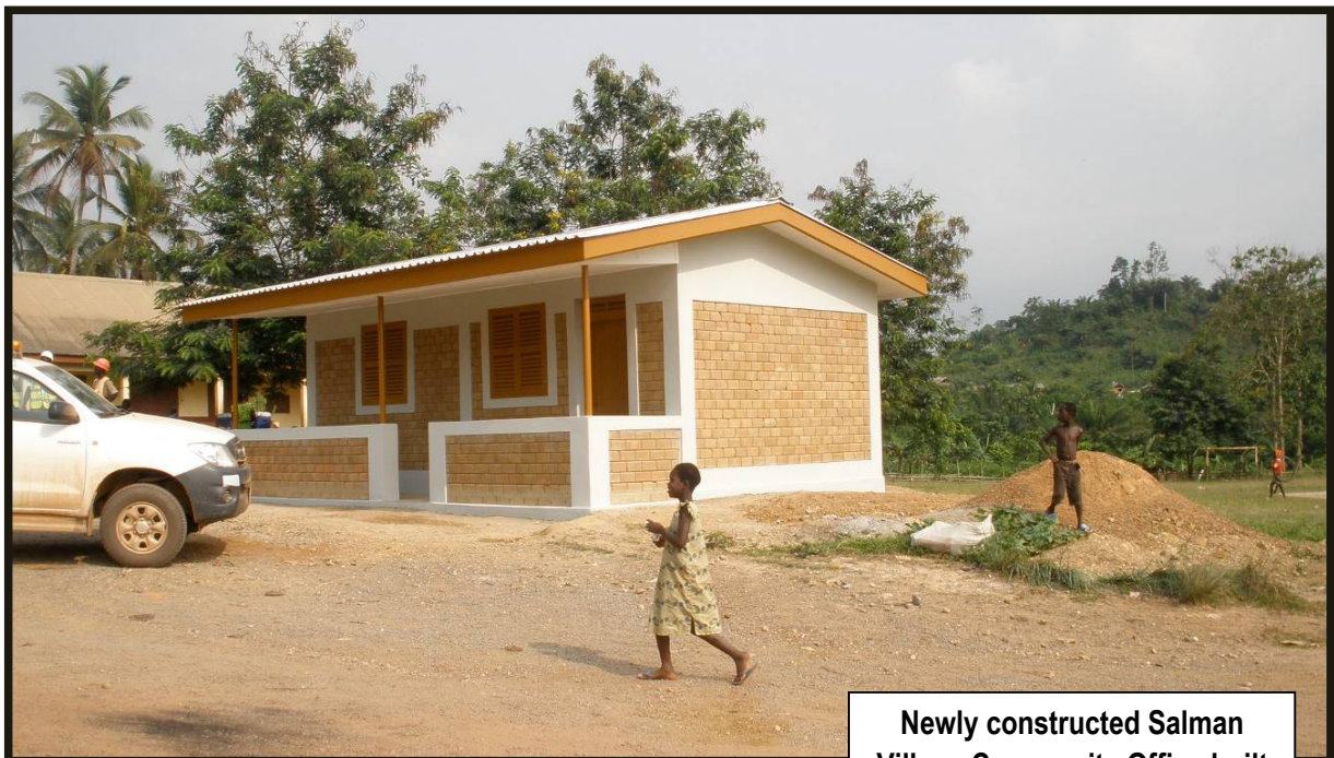
Newly constructed Salman Village Community Office built for demonstration purposes