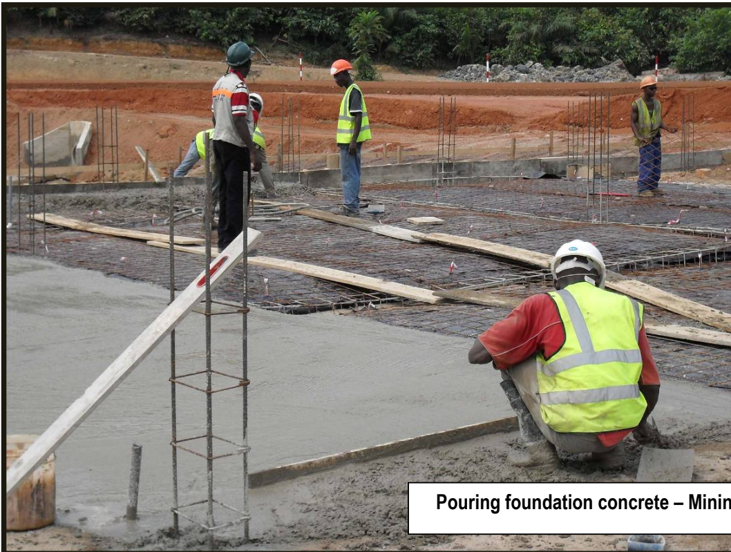
Pouring foundation concrete – Mining Office