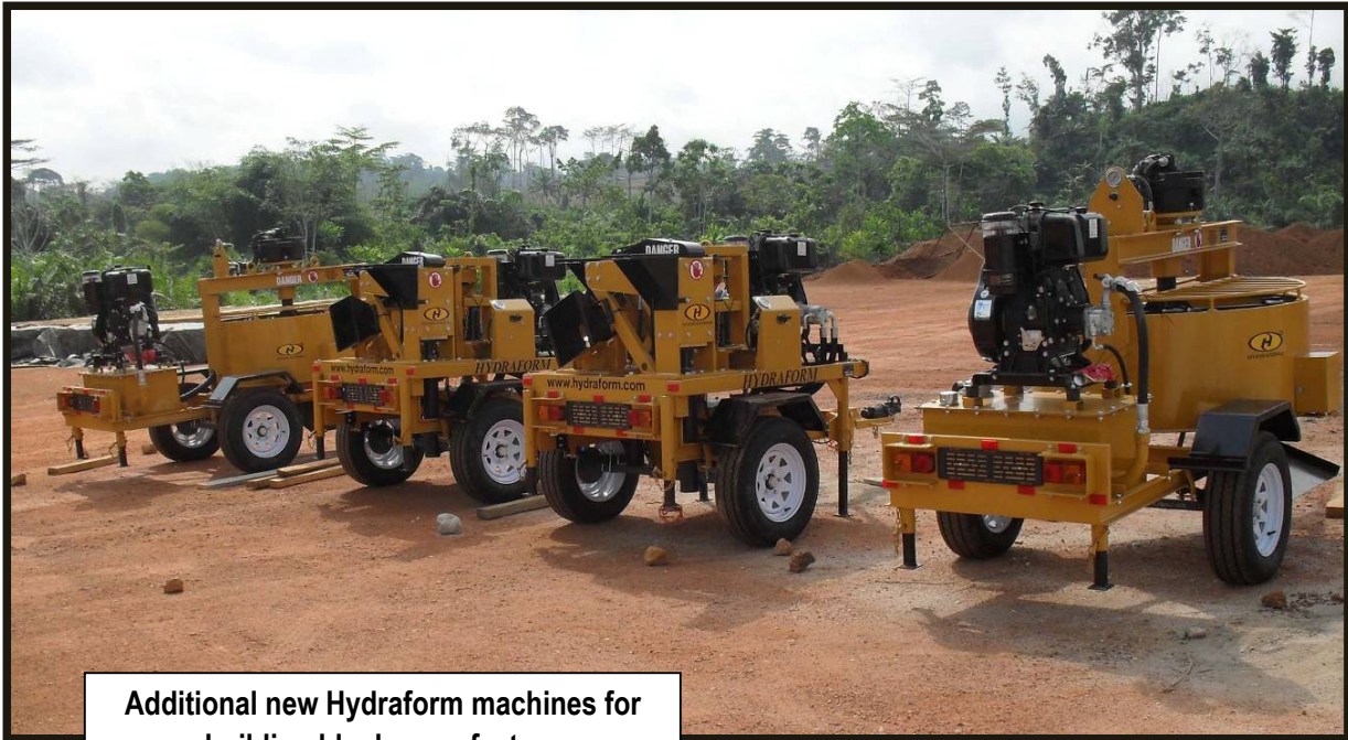
Additional new Hydraform machines for building block manufacture