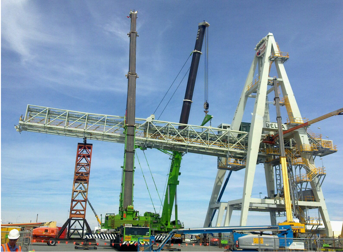
Figure 4: Utah Point Port ship loader erect