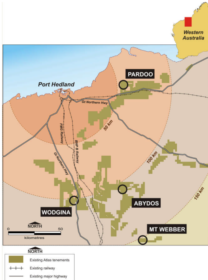
Figure 1: Atlas Northern Pilbara Projects Location Plan