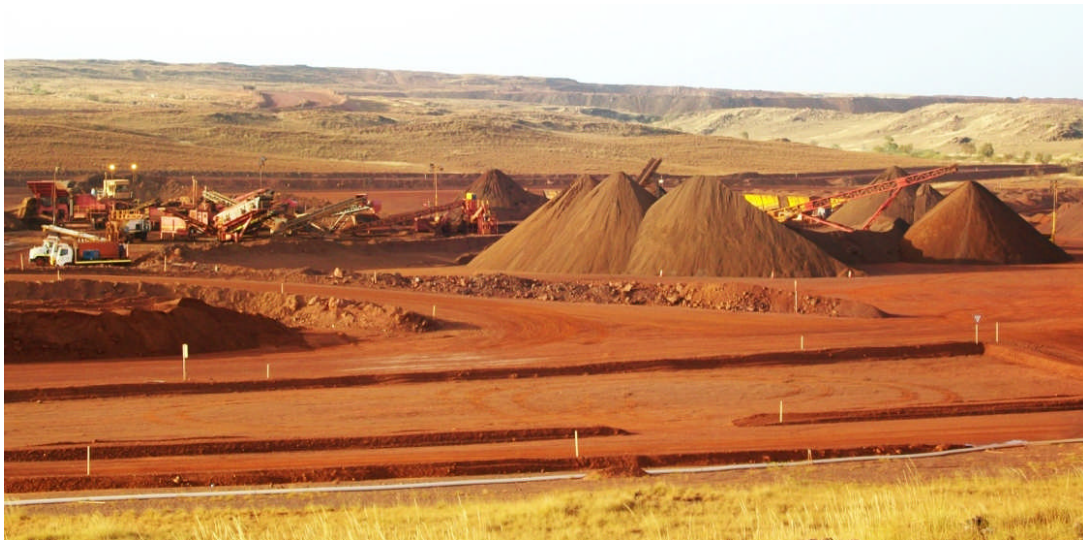
Figure 3: Upgraded Pardoo Facilities - Crush and Screen Plant