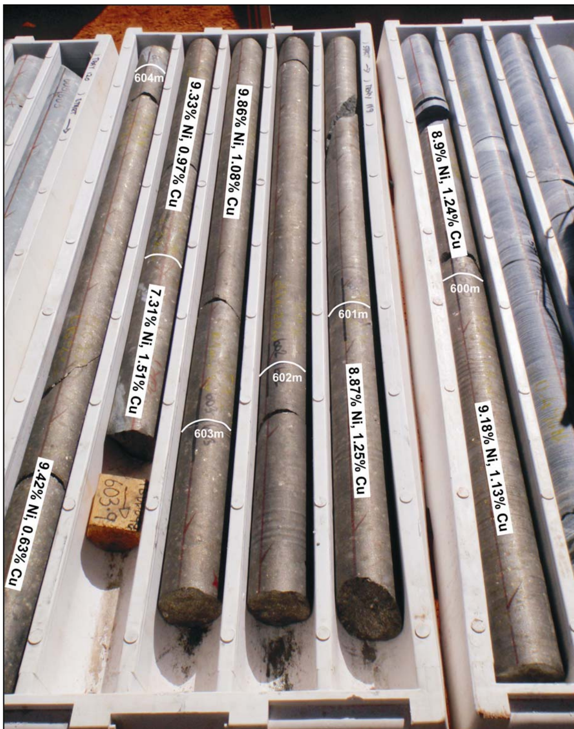
Figure 1: Duketon JV Rosie Prospect - TBDD098 Massive Sulphide Intercept 5.20m @ 9.13% Ni, 1.09% Cu, 0.21% Co and 7.09g/t PGEs (PGEs include 2.22g/t Pt, 1.74g/t Pd, 0.82g/t Rh, 1.79g/t Ru)