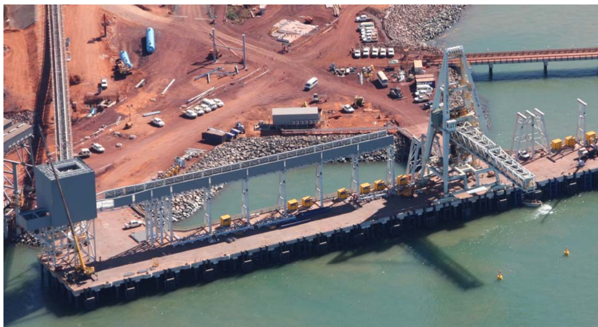
Utah Point Multi User Berth (with locally constructed 7,500 tonne/hr ship loader in place)