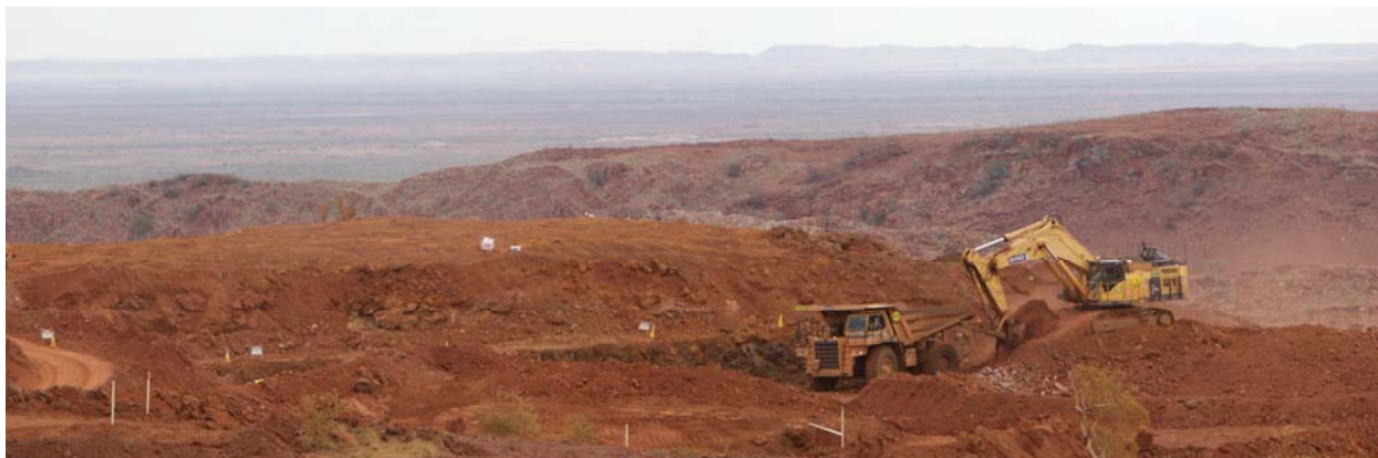
First mining at the Anson Deposit, Wodgina

In June 2010 mining started at Atlas' Wodgina DSO Project, located 110 kilometres south of Port Hedland in the Pilbara of Western Australia (see Atlas announcements dated 30 April and 21 June 2010). With the commencement of mining at Wodgina and the scheduled delivery of the new multi-user port at Utah on 17 September, Atlas is on track to more than quadruple combined Pilbara iron ore exports to 6Mtpa rate by December 2010.