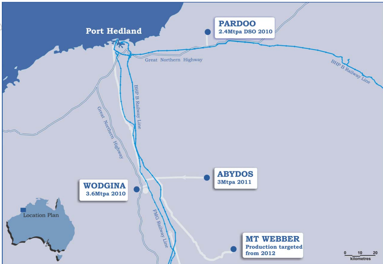
Atlas Iron Limited's North Pilbara Projects

the proposed Abydos and Mt Webber mines through a centralised crushing and screening facility. The Pre Feasibility Study is now being concluded, with results including upgraded reserves to be announced in the September 2010 quarter.