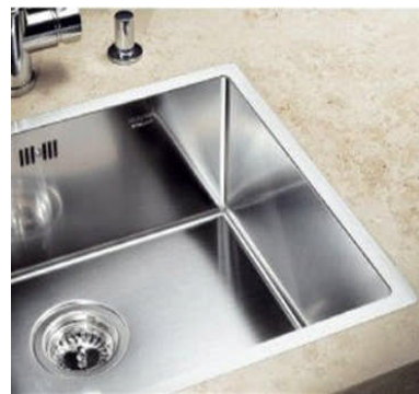
Stainless steel sink