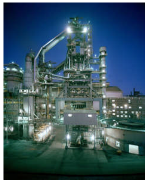
Stainless in process plant