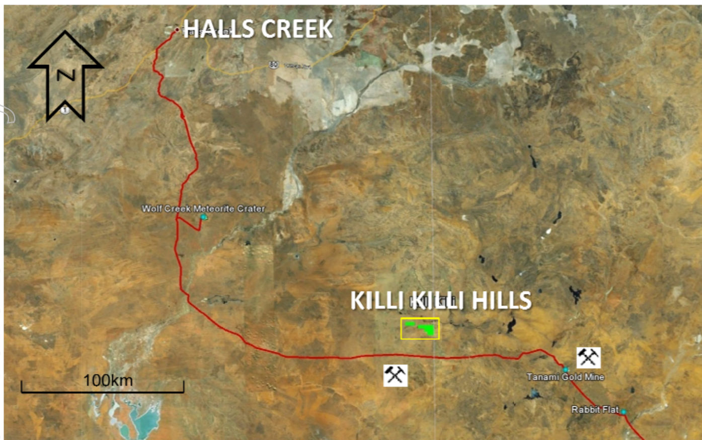
Diagram 3: Halls Creek – Alice Springs Road and the Orion Killi Killi Hills tenements

The Directors believe that the Killi Killi Hills project will be a very attractive addition to Orion's existing Gold and Rare Earth projects at Fulford and Bonner Creek in North Queensland and will complement the company's ongoing strategy to develop HREE and gold opportunities.