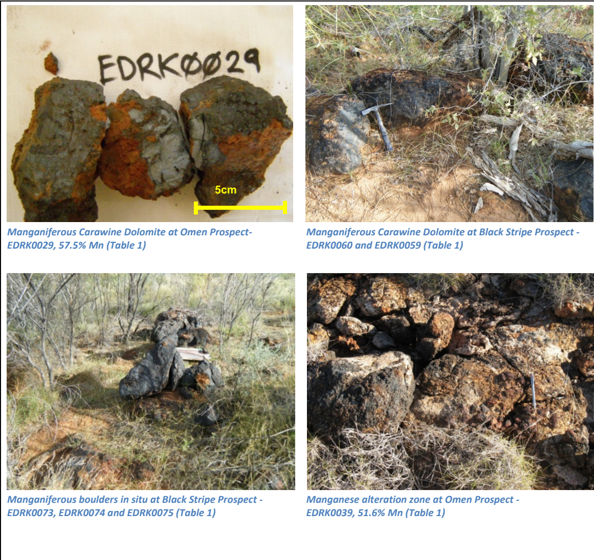
Figure 2 – Selected Images – Enachedong Manganese Project