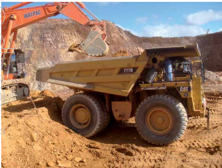
Mining at BrightStar Beta

While our main focus has been on getting into production, the Group has maintained a positive exploration programme on the Brightstar leases, primarily on Beta. With extensive drilling on Beta for grade control requirements, A1 has been able to find extensions of gold mineralisation to its initial targets. This has resulted in an additional pit near the plant (turtle zone) which has the potential to significantly increase production from the Beta lease (which is where the plant is located).