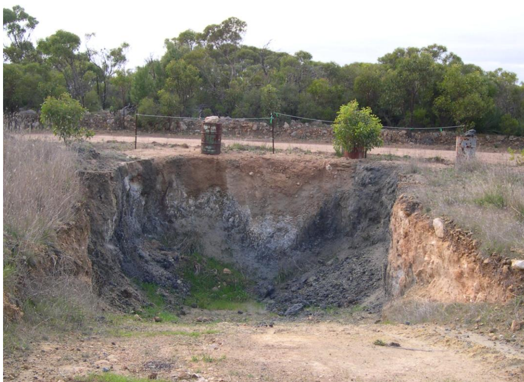
Pic 2. Previously dug out section at Main Road.