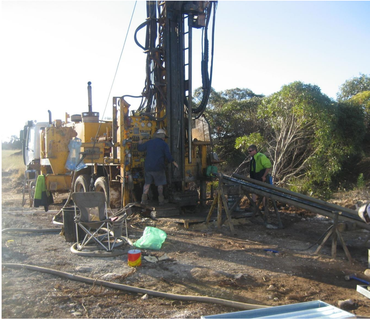
Drilling in action at Uley Main Road