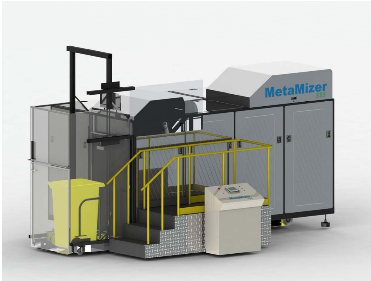
MetaMizer 240 SSS Biohazardous Waste Converter