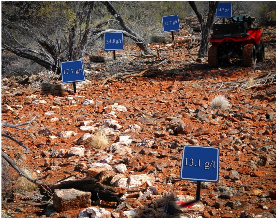
Table 1> Significant rock chip results from recent detailed Black Dog extension sampling (above 1.0g/t)