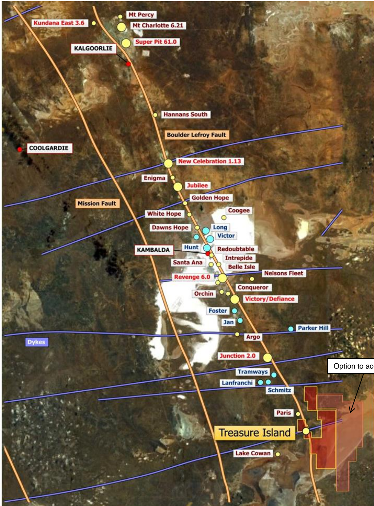
Figure 1: Location of the Treasure Island Gold Project on the Boulder Lefroy Fault