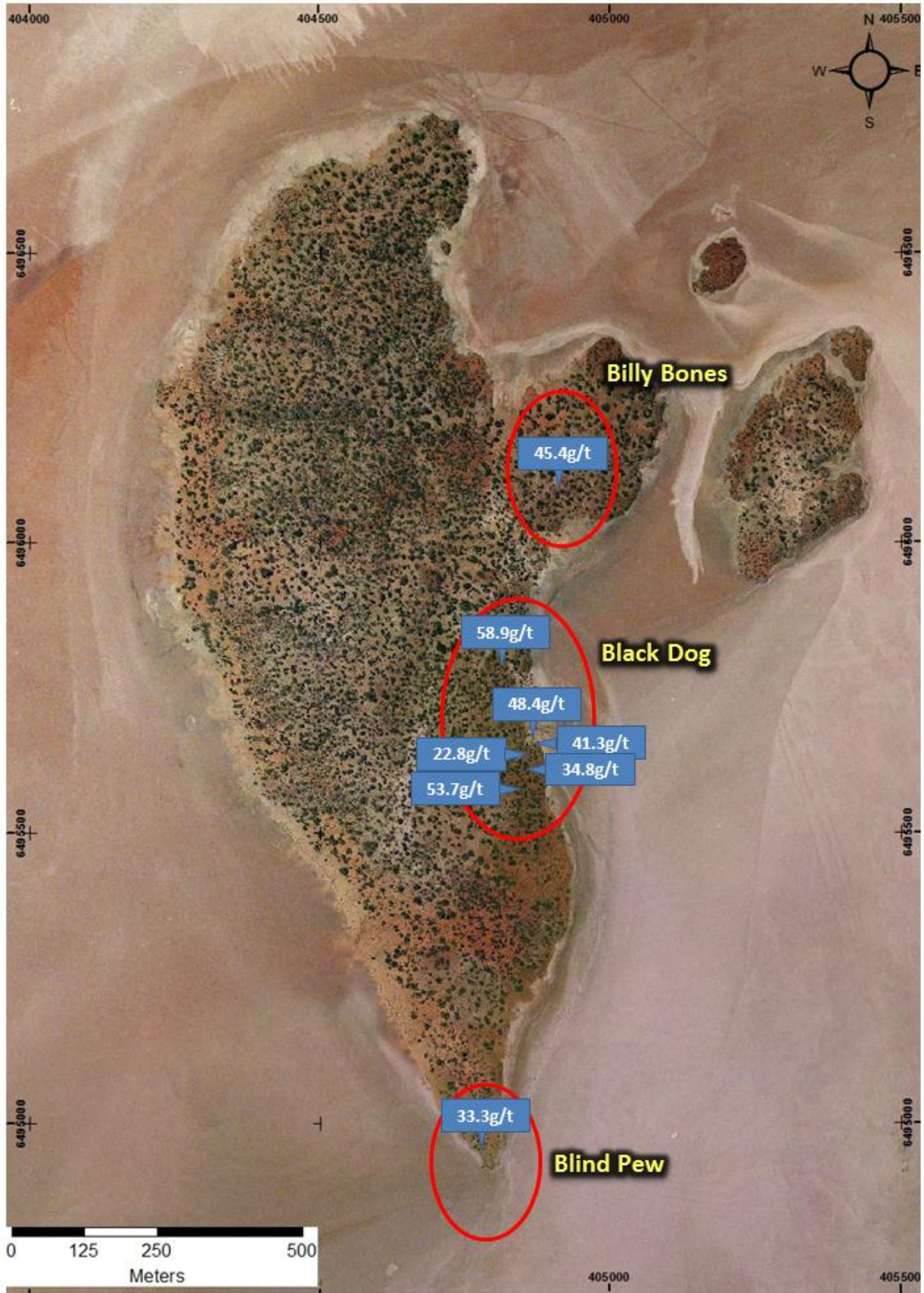
Figure 2: Results from rock chip sampling on Treasure Island.