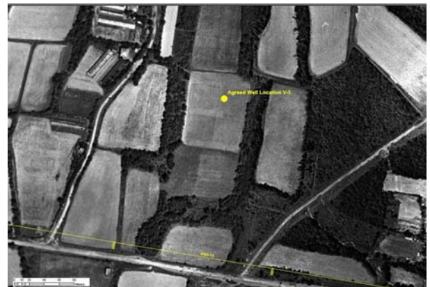
Figure 1 & 2 – Mukhiani Well site location on the Vani 3 Prospect