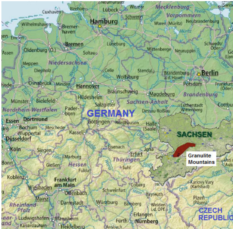
Figure 1 – Location of the Granulite Mountains Licence Area.

The licence is considered prospective for nickel, cobalt, copper, chrome, silver and gold. The project acquisition is through an initial option payment of €40,000 which will be followed by a due diligence period of three months, after which a payment of €160,000 would give Proto 100% ownership of the project.