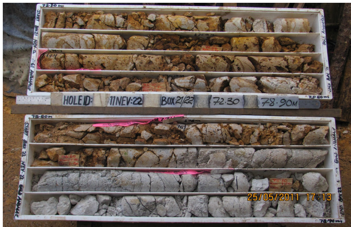
Plate 1: NEV022: Drill Core from 72.30m to 78.90m

The Mineralisation intersected in NEV022 is associated with intersecting fracture sets and occurs along the fracture faces, this differs from the main zone where it is predominantly associated with base – metal carbonate veining.