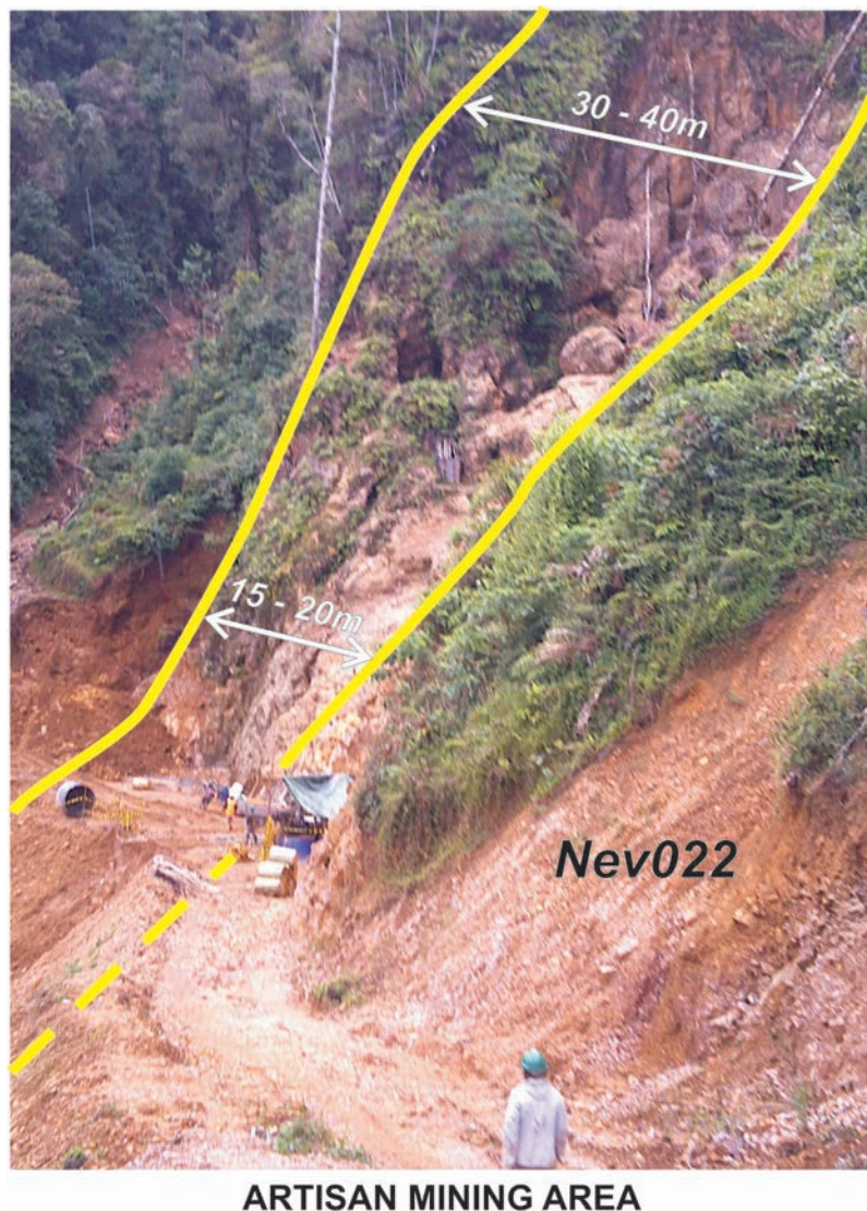
Figure 1: Drilling NEV022 at the Artisanal Mining Area

Drill rig on NEV022 at the base of the slope, with the artisanal mining area highlighted.