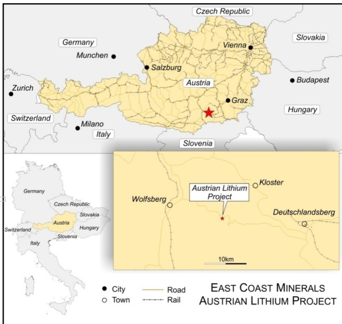
Figure 2: Austrian Lithium Project Location