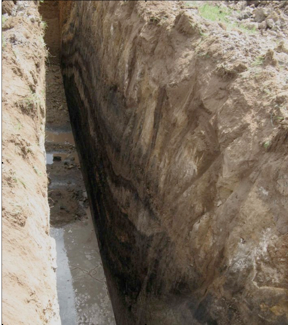
Figure 1: Trench 01 showing coal in base of trench