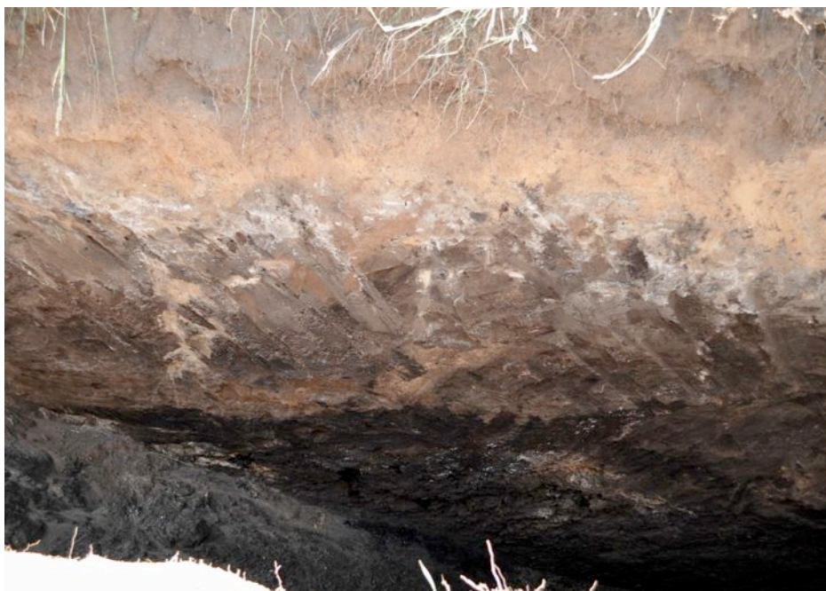
Figure 2: Trench 02 showing coal in base of trench