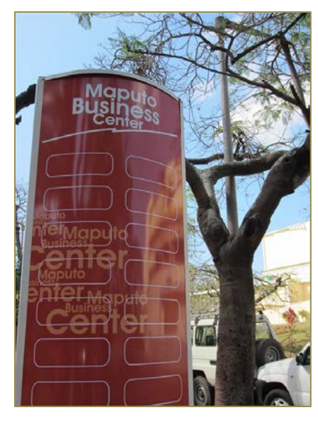
Figure 1: New Maputo Office.