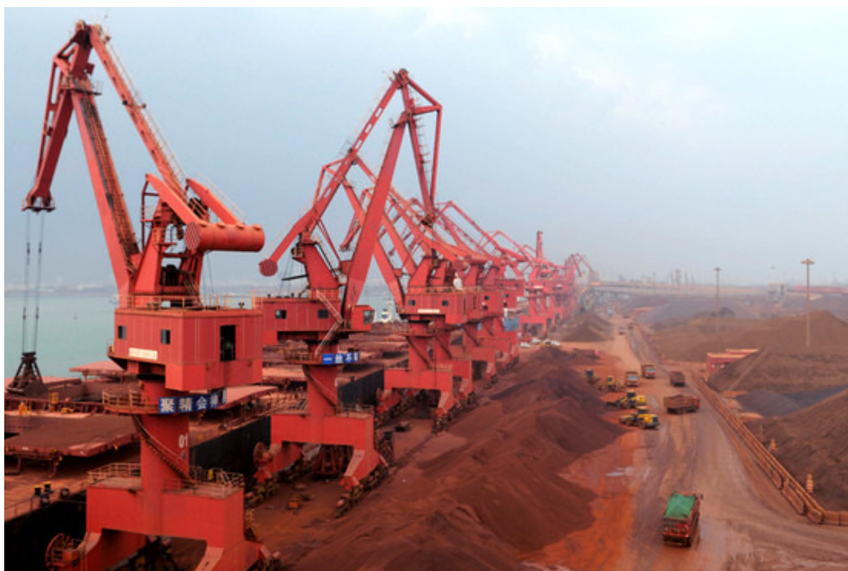
Figure 4: Iron Ore stockpiles in Southern China

Sale of the first two years of production from stage one of the project have already been secured under a comprehensive sales contract and marketing agreement between IronClad and OM Materials Pte Ltd of Singapore, a subsidiary of OM Holdings Limited (OMH). OM Materials will ship the ore to a stockpile in southern China (Figure 4) for sale directly to the steel mills at prices mutually established from several world iron ore pricing indices.