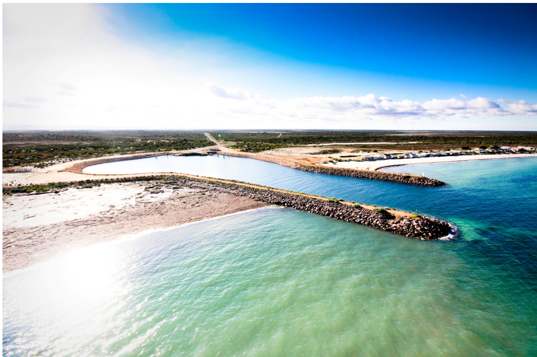
Figure 1: Existing Lucky Bay facility

The exercise of the option gives the Company full access to a designated 50 hectare site, with harbour frontage and full usage of the port itself. This paves the way for a two stage transshipping operation due to commence very early in 2012.