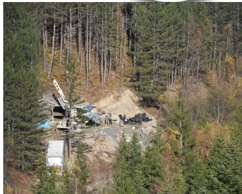
Drilling program at Monty – Nov 2011