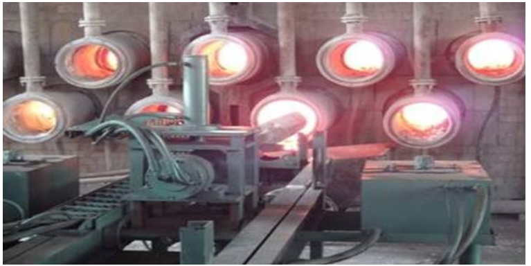
Existing furnace in production