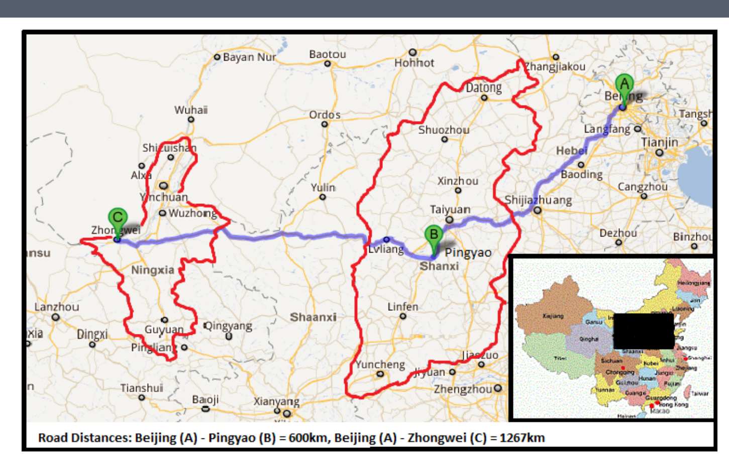
Location of magnesium plant in Pingyao (B) (dolomite quarry located 30km from Pinyao operations) and ferrosilicon plant in Zhongwei (C) northern China - all accessible via sealed road and/or rail