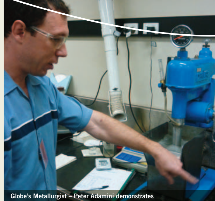
the flotation test pilot

The site arrangement plan is now at an advanced stage with all major features located. Hydrology, hydrogeology and geotechnical studies are also progressing well.