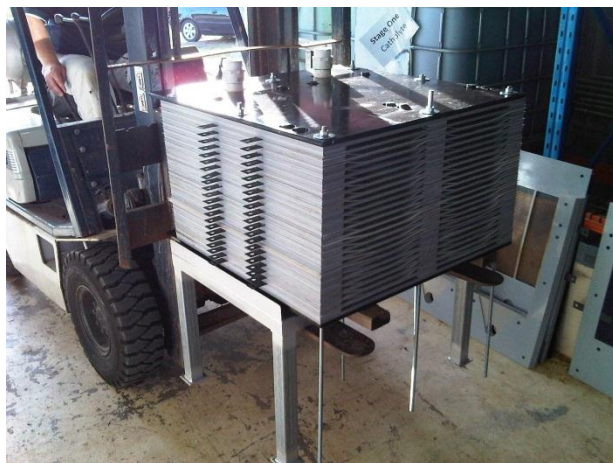
Figure 6 (left) – Dow Chemical selective nickel low-pH Ion Exchange resin Figure 7 (right) – The new cell designed for the Barnes Hill flowsheet moving into position

With completion of the reconfiguration of the process, the pilot remains on schedule for operation from January 2012. The fact that Barnes Hill ore will be pilot the Barrier Bay technology first provides the Company with substantial early-mover advantages and Proto looks forward to updating the market on progress as it continues to advance Barnes Hill towards production.