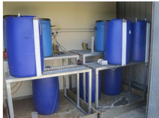
Figure 1 (left) – Bottle roll testwork on Barnes Hill saprolite samples Figure 2 (right) – 30kg atmospheric vat leach testwork