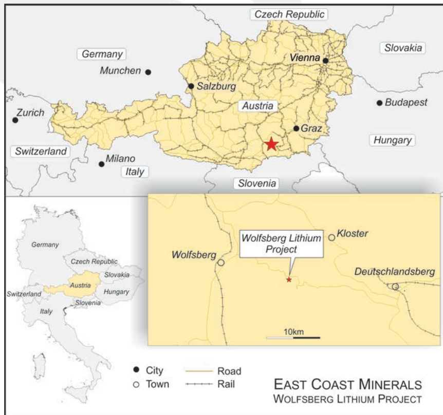
Figure 2: Wolfsberg Lithium Project Location