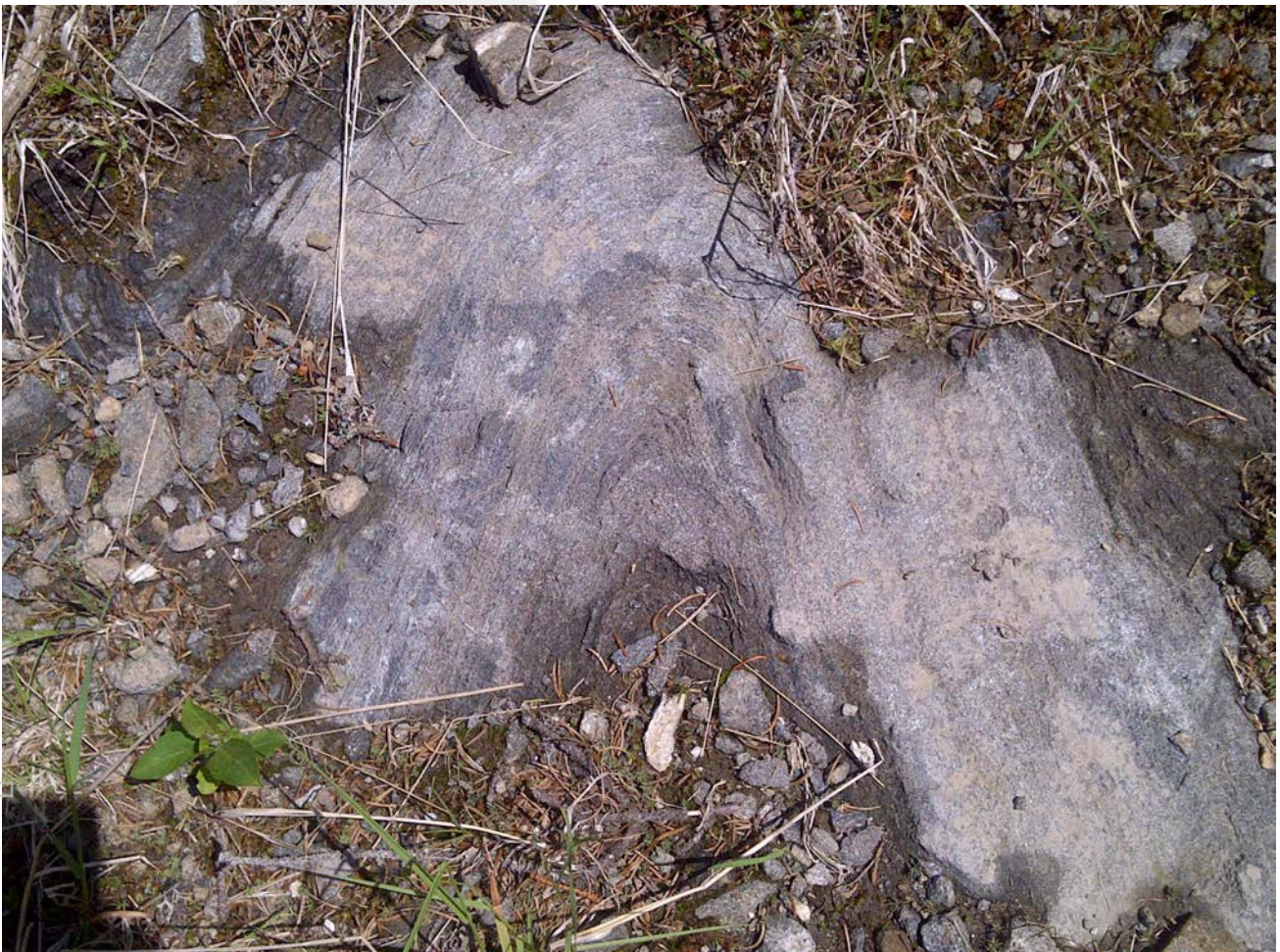
Photo 2: The hinge axis between Zone 1 on the left and Zone 2 on the right.

A systematic surface sampling program will be initiated in spring. Samples from the Pegmatite boulders will be submitted to a laboratory for assay. The results of the assays will test the presence of smaller Spodumene (the lithium mineral) crystals.