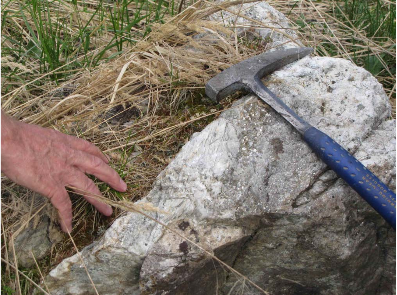
Photo 1: Zone 2 Pegmatite with hand sized Spodumene crystal in centre of photo.

The Zone 2 area investigated, strikes over 1.4km and reaches from approximately 1500m asl (above sea level) to 1850m asl. The topography is characterised by steep flanks but due to a network of forest roads, access to the area is excellent.