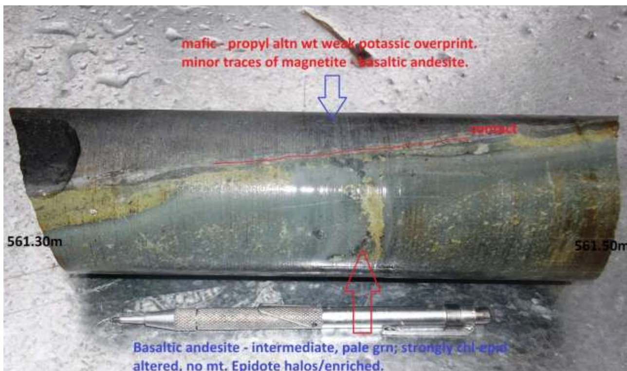
Photo 2: Contact zone, epidote rich basaltic andesite in contact with weak potassic overprinting zone.