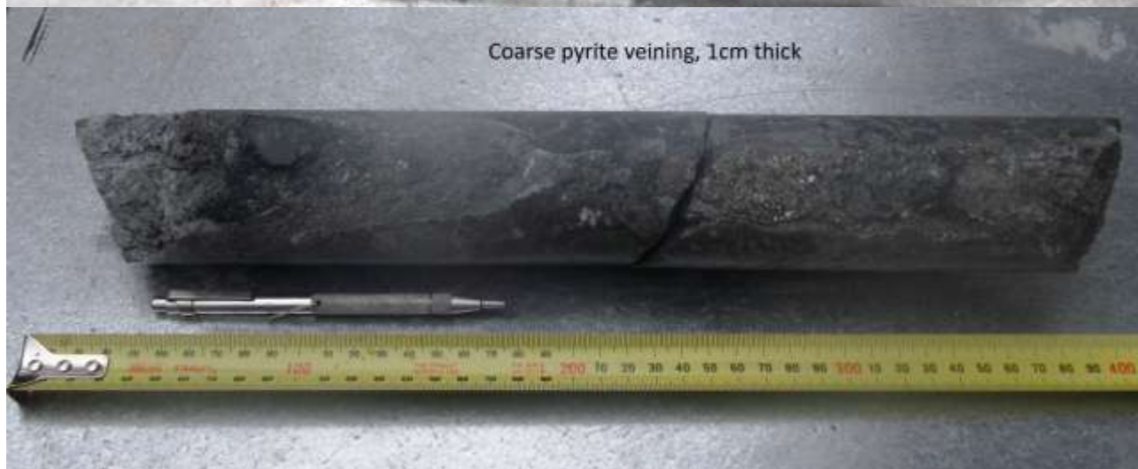
Photo 1a and b: Vein extends up to 30cm and infill with semi-massive coarse pyrite (>10%) grains and quartz, k-feldspar and carbonate, range between 576.70 – 577.60m.