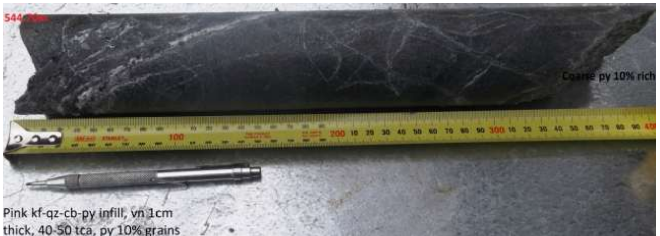
Pink kf-qz-cb-py infill, vn 1cm thick, 40-50 tca, py 10% grains