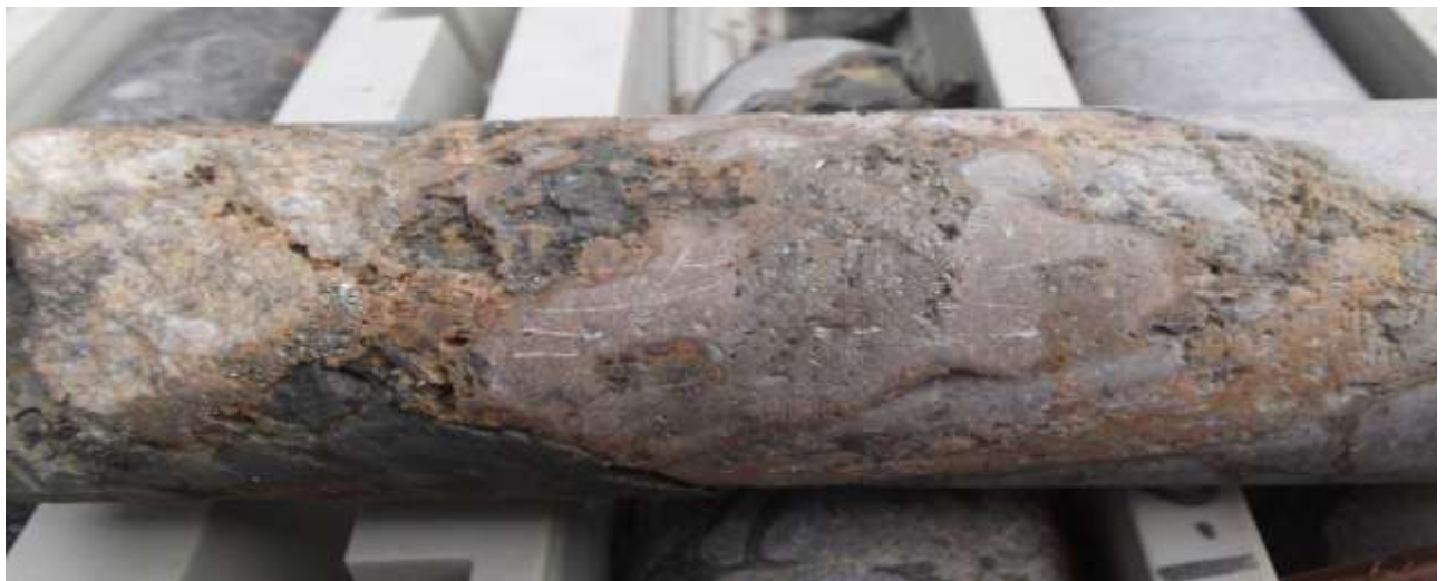
Photo 4: Quartz- pyrite-kfeldspar/siderite? breccia band from 360.90-361.10m. Notice the pyrite bleb in the centre of image and orange yellow k-feldspar (?) and or siderite?