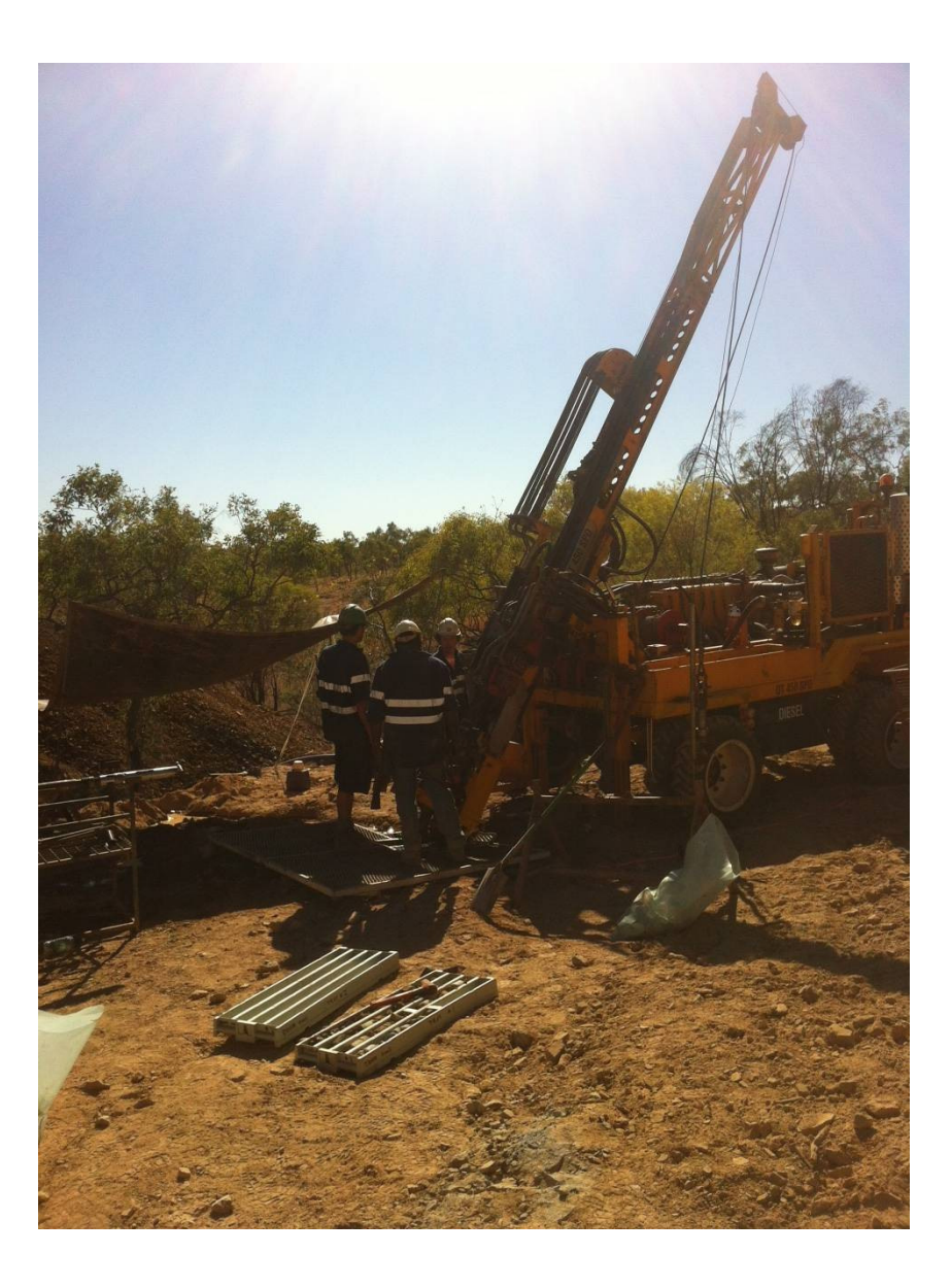
Figure 2 – Diamond drill rig on site at Homeward Bound

Centius' drilling program at Homeward Bound commenced on 13 July 2012, and Phase 1 is due to be completed in two weeks. During Phase 1, a line of RC and diamond holes will be drilled across the centre of the prospect at 50m spacing will be drilled to an approximate depth of 100m.