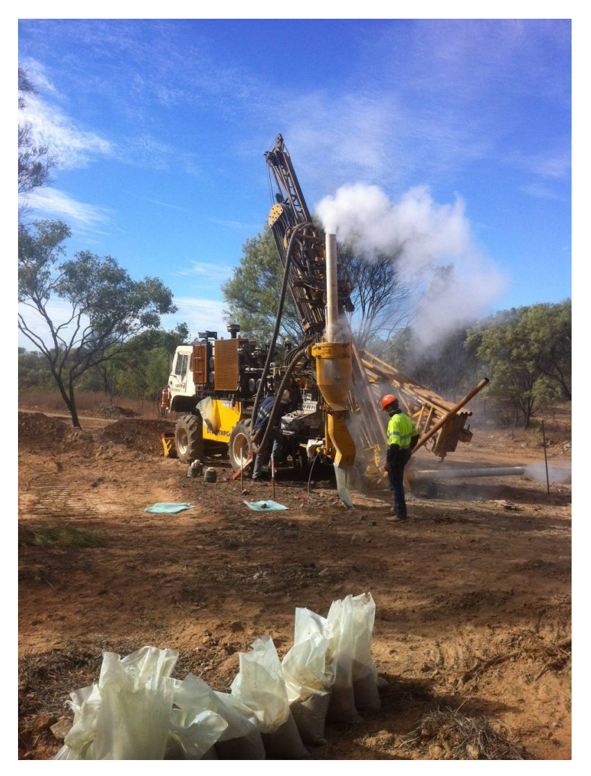
Figure 1 – RC drill rig on site at Homeward Bound

Sydney, 19 July 2012: Australian gold and base metals exploration company Centius Gold Limited (ASX:CNS) has commenced a comprehensive drilling program on the Homeward Bound prospect at Croydon, Queensland (EPM18448). The program is designed to confirm the results from a previous RC drilling program conducted by Central Coast Exploration in the late 1980s and early 1990s. The results from the previous drilling program did not match the historic grades of 35.0 g/t Au from 22,000 tonnes of ore processed through a gravity plant in the period from 1890 to WW1.