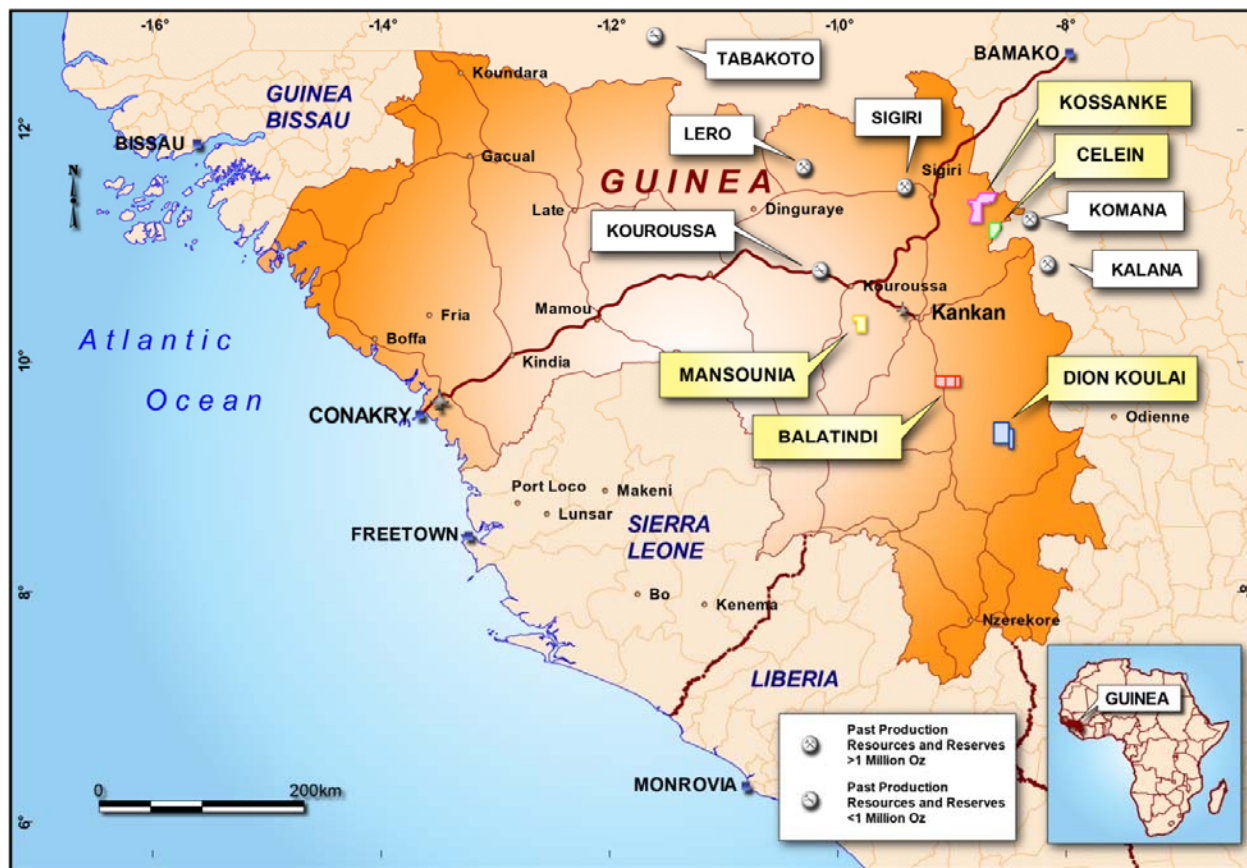
Figure 2: Kossanke location map