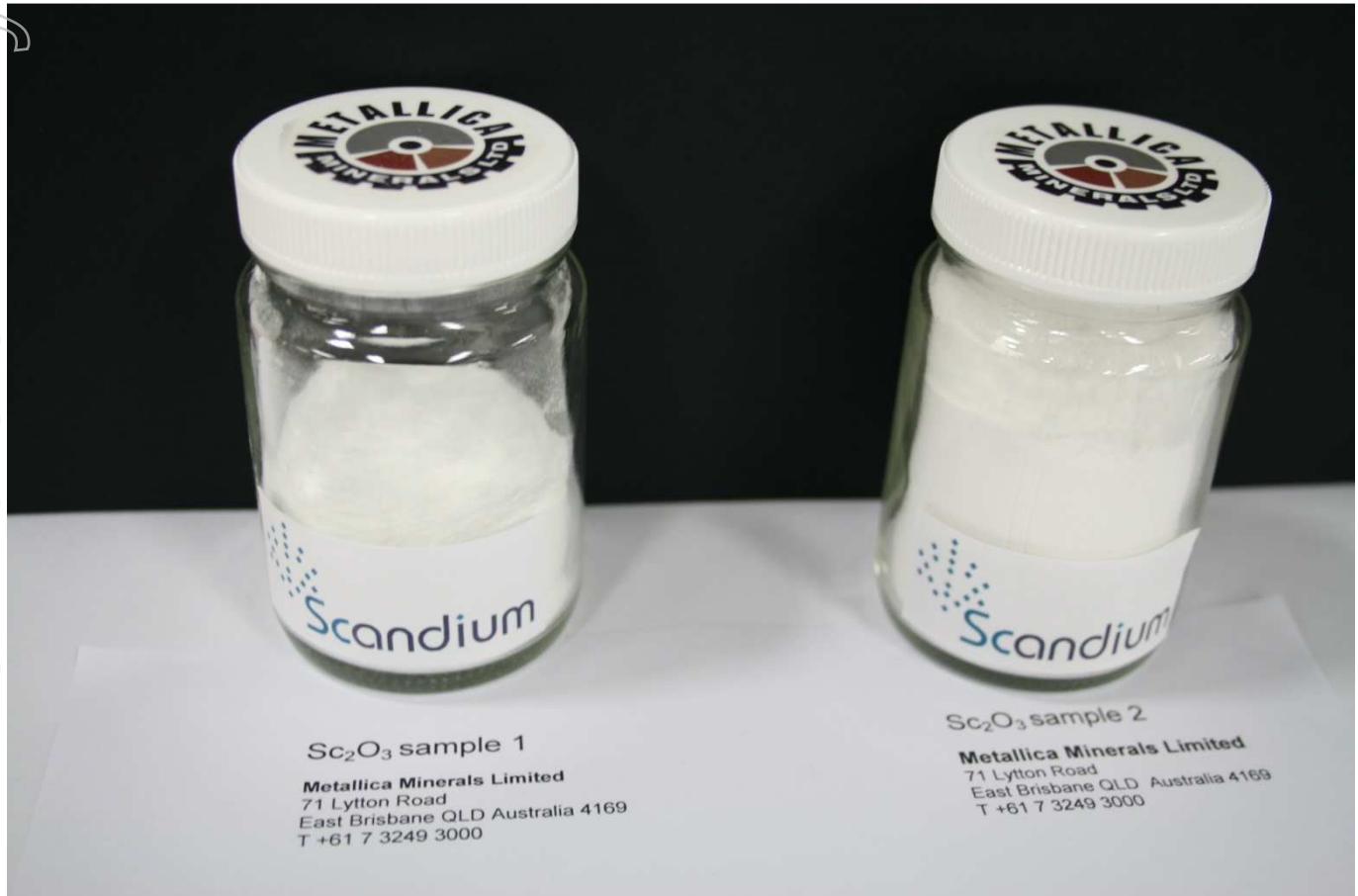
Figure 2: Scandium oxide produced by Metallica

Scandium oxide appears as a free flowing white powder, as seen in Figure 2 below: