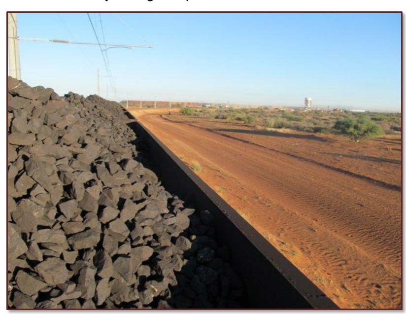
Tshipi Borwa - First Train of Lumpy Manganese Ore

Jupiter Mines Limited (ASX: JMS) is pleased to announce that the Tshipi Borwa Mine, in which it has a 49.9% stake, has successfully loaded its first full trainload of manganese ore on Sunday, November 18<sup>th</sup> 2012.