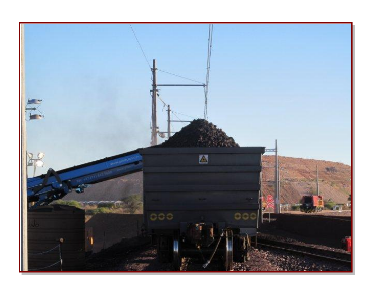
Tshipi Borwa - Train Loading