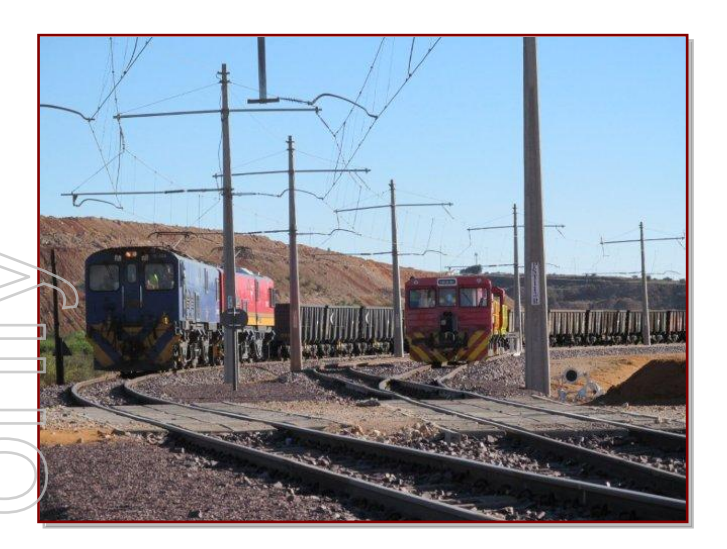
Tshipi Borwa -Train Arriving