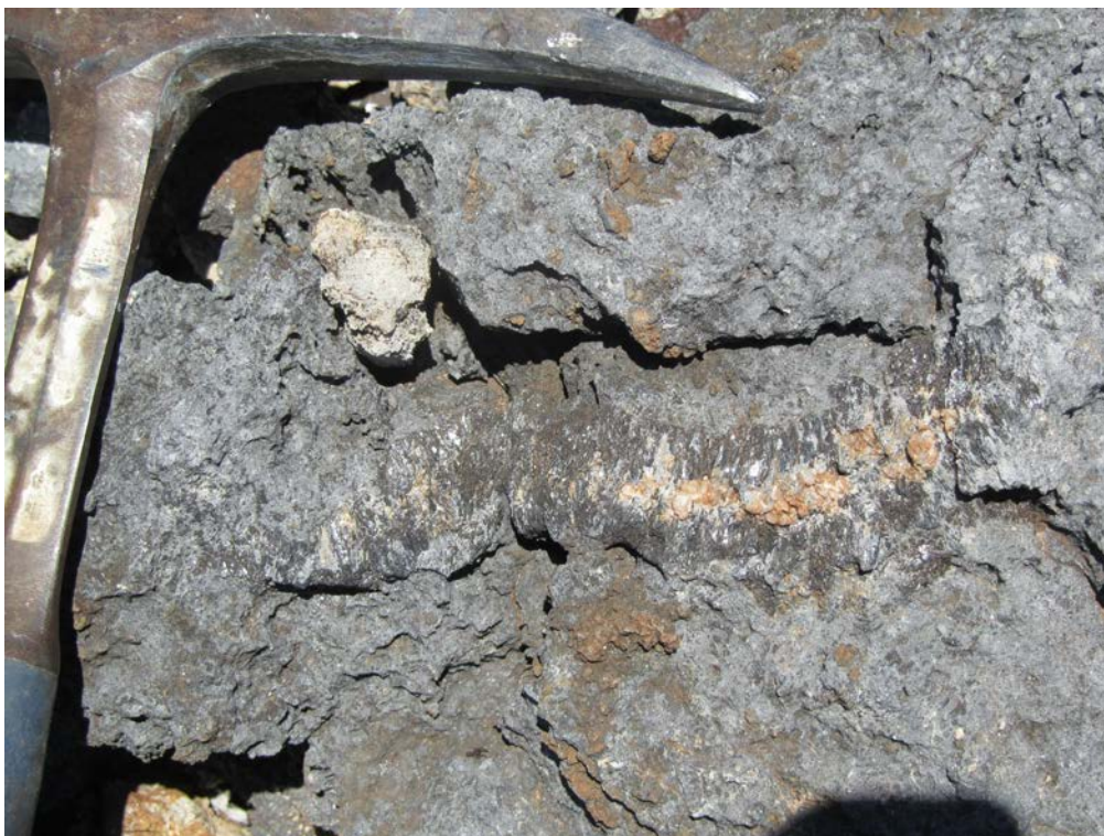
Figure 3. Coarse flake graphite vein hosted within high-grade, fine grained graphite rock.