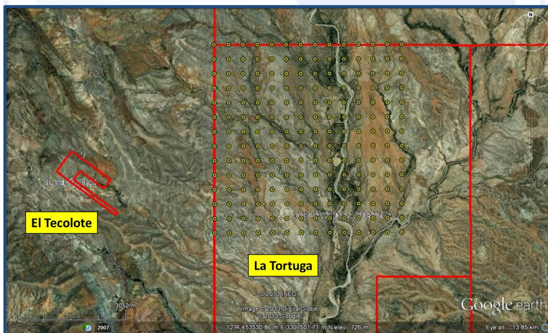
Figure 1: Gravity stations (yellow dots) over Google Earth satellite image showing internal tenement boundaries (in red).