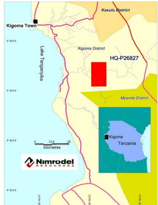
Map 1: General Location of HQ-P26827