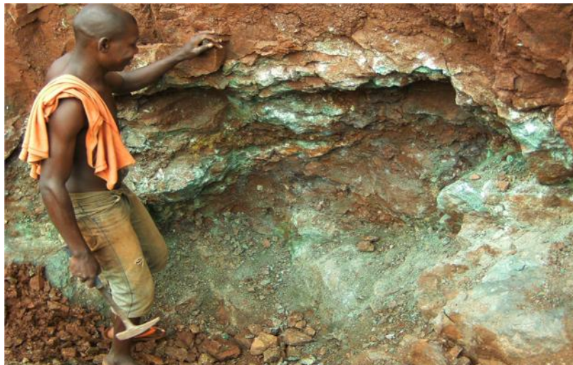
Photo 2: Outcrop of malachite mineralisation in breccia. (Luhwanya Mine Locality)

The above images taken at the Luhwanya artisanal dig and load operation is contiguous to HQ-P26827.