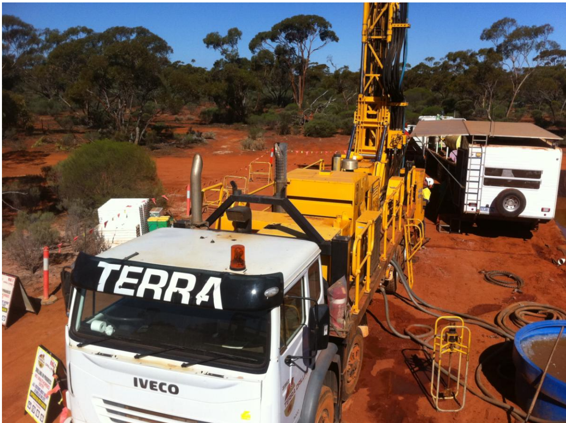
Figure 2. Diamond Drilling at Mt Vettters

As announced to the ASX on the 8 th February 2013, Proto had commenced the diamond tail to the Reverse Circulation hole PRC1 at Mt Vettters (see Figure 2).