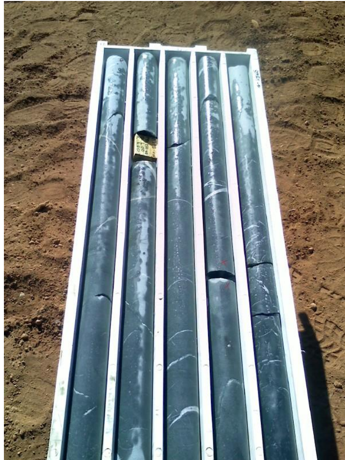
Figure 4. Diamond drill core from PRC1

Shareholders and interested parties should direct their enquiries to;