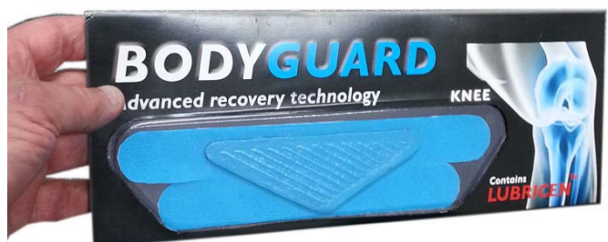
Early BodyGuard Packaging Concept