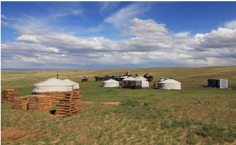
Figure 2: Camp set up at Shanagan