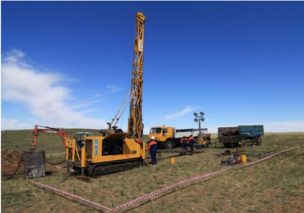
Figure 1: Drilling of DH29 is underway in the potential new coal zones in the north of the Shanagan License