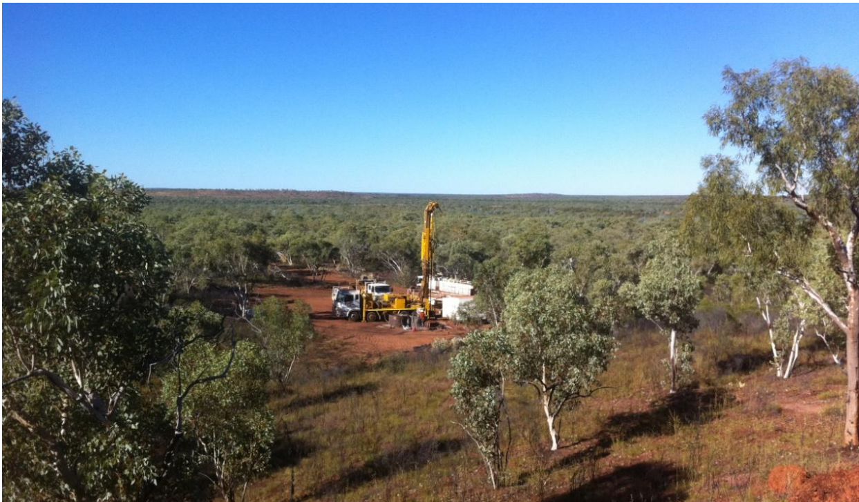
Figure 1: Diamond drill rig at Lindemans Bore