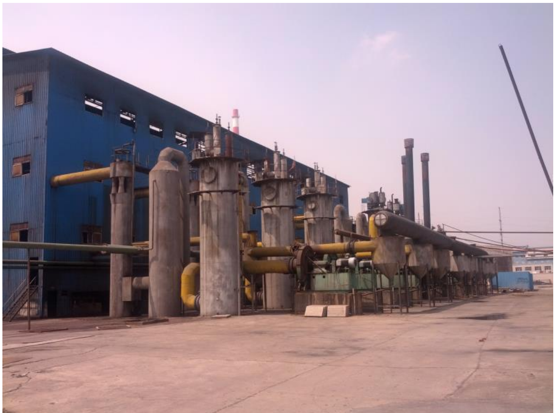
Gasifiers-Coal to Semi Coke and waste gas used to heat ovens