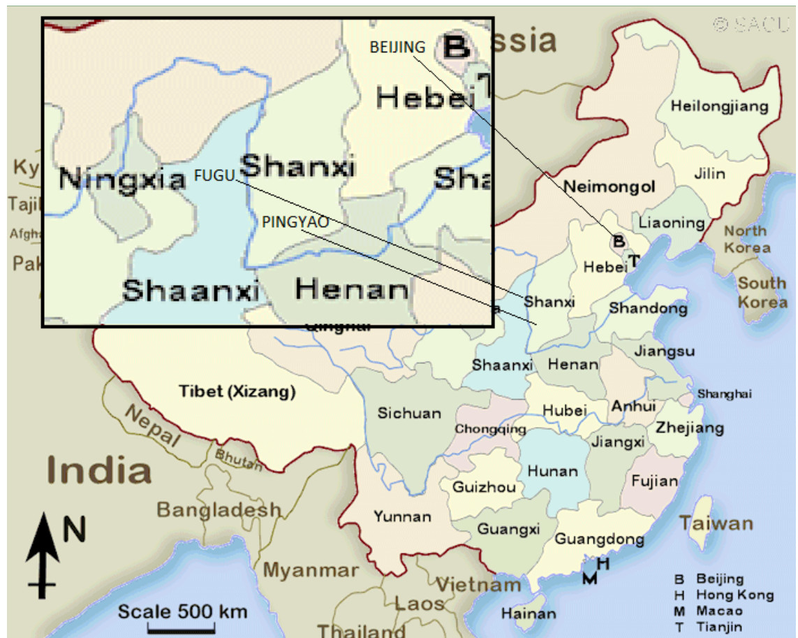
Location of the CMC's magnesium production operations in Pingyao, Shanxi province and the proposed semi coke / magnesium operations in Fugu, Shaanxi province, both in northern China

"We also expect it to make a substantial contribution to CMC's profitability in the 2014 financial year".