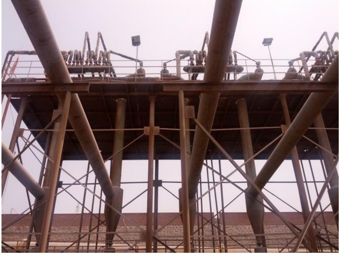
Steam powered vacuum system-steam from waste heat recovery system of rotary kiln