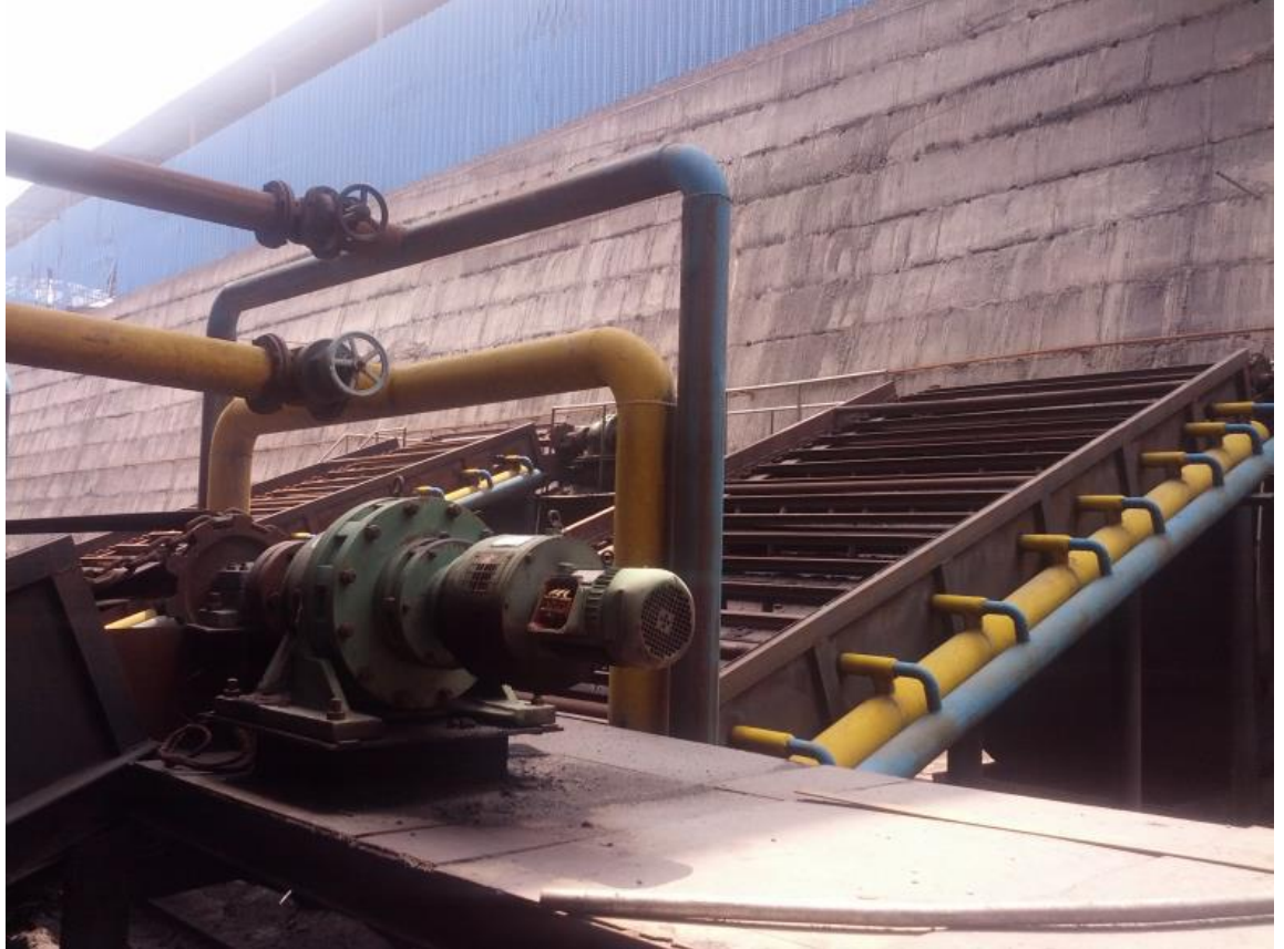
Discharging semi coke (1)