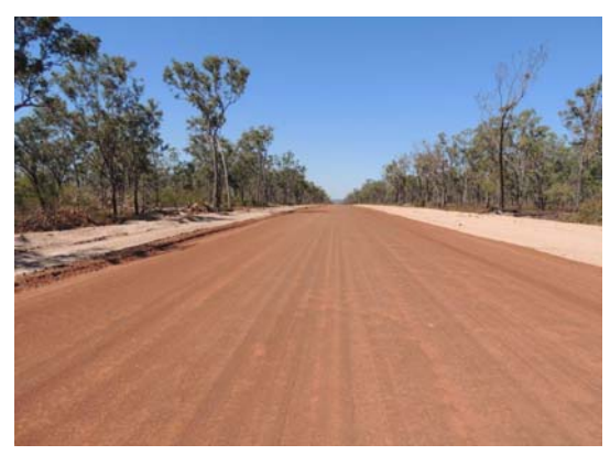
WDR's privately-owned haul road to Bing Bong loading and export facility