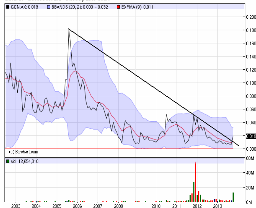
GCN.AX - Goconnect Ltd - Monthly Line Chart