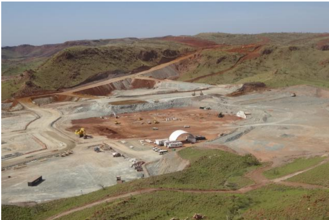
Photo 1 - Mt Webber ROM Pad, Ramp to the Ibanez Pit and Mining

Mining operations commenced in December, with first haulage to port planned for the Jun14 Qtr.