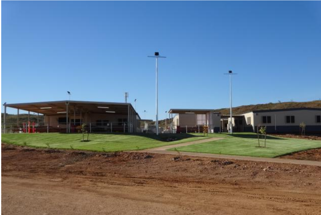
Photo 2 - Mt Webber Camp Facilities

Feasibility works for Mt Webber Stage 2 project have continued to progress. A focus to reduce costs has revealed further capital and operating cost reduction opportunities, relative to previous estimates. The key operating cost for Stage 2 (prior to any rail solution) is road transport and this cost is now well understood, following execution of the road haulage transport contract with McAleese Resources. Atlas expects that Mt Webber Stage 2 (6Mtpa run rate) operating costs will be broadly comparable with the current year operating cost guidance range.