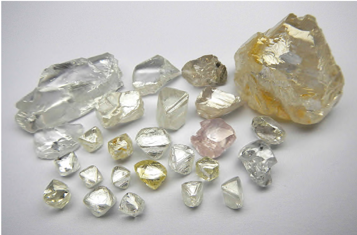
Lulo diamonds included in 371.35 carat parcel approved for sale

The 371.35 carat valuation package will be the second parcel of Lulo diamonds to be sold. As announced on 31 July 2013, Lucapa sold its first parcel of Lulo diamonds, weighing 496.2 carats, for gross proceeds of $3.12 million, from which Lucapa received net proceeds of $2.7 million.