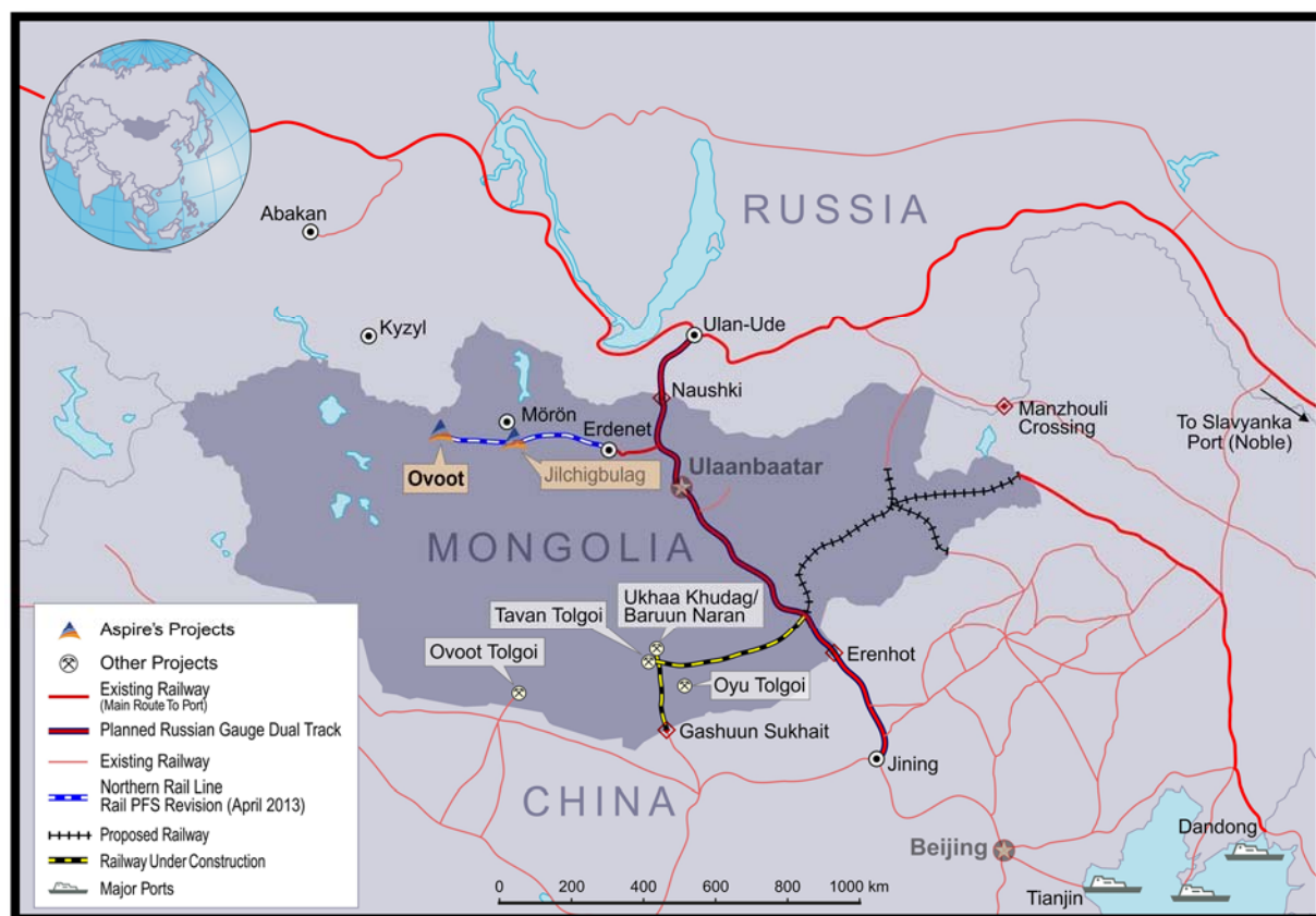
Figure 1: Aspire and Northern Railways Project Locations in Mongolia

Aspire’s wholly owned Mongolian rail infrastructure subsidiary, Northern Railways LLC (“ Northern Railways ”) continues to focus on progressing its railway project (“ Northern Rail Line ”), which will extend a multiuse railway from Erdenet to the Ovoot Project.