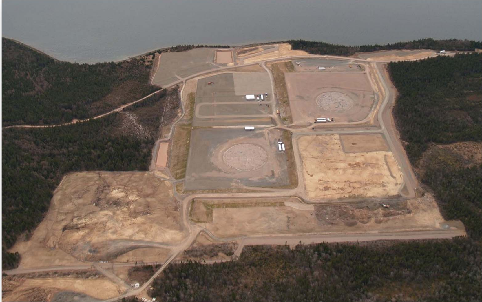
Figure 1: Aerial View of the Bear Head LNG Project Site, Nova Scotia, Canada