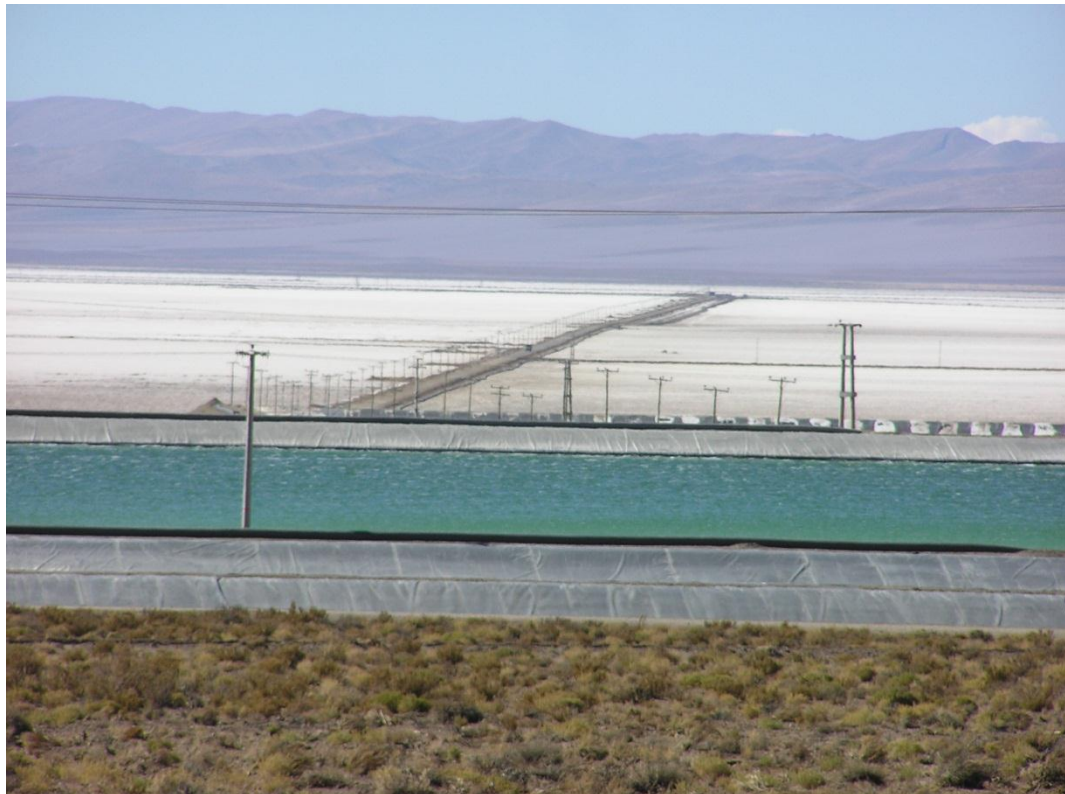
Brine holding pond and road across the salar