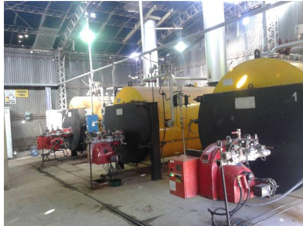
Boilers at Tincalayu