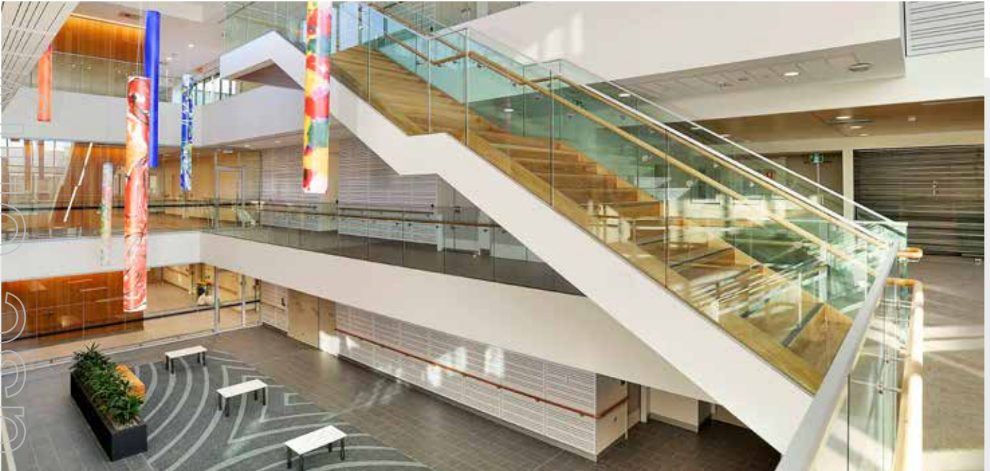
Port Macquarie Base Hospital