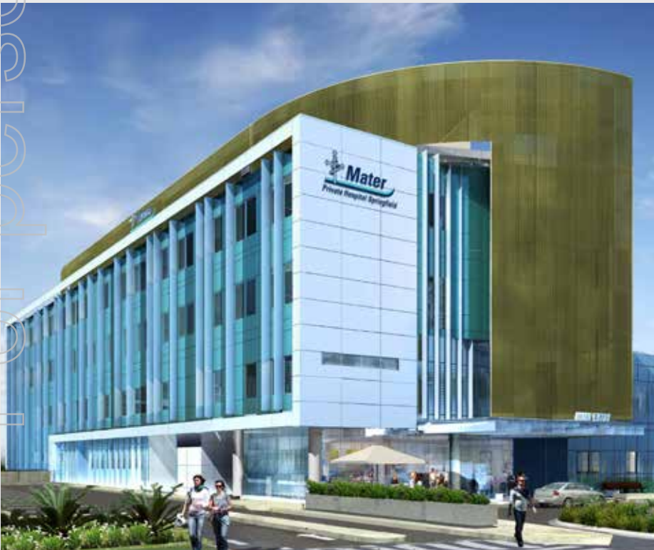
Mater Private Hospital Springfield