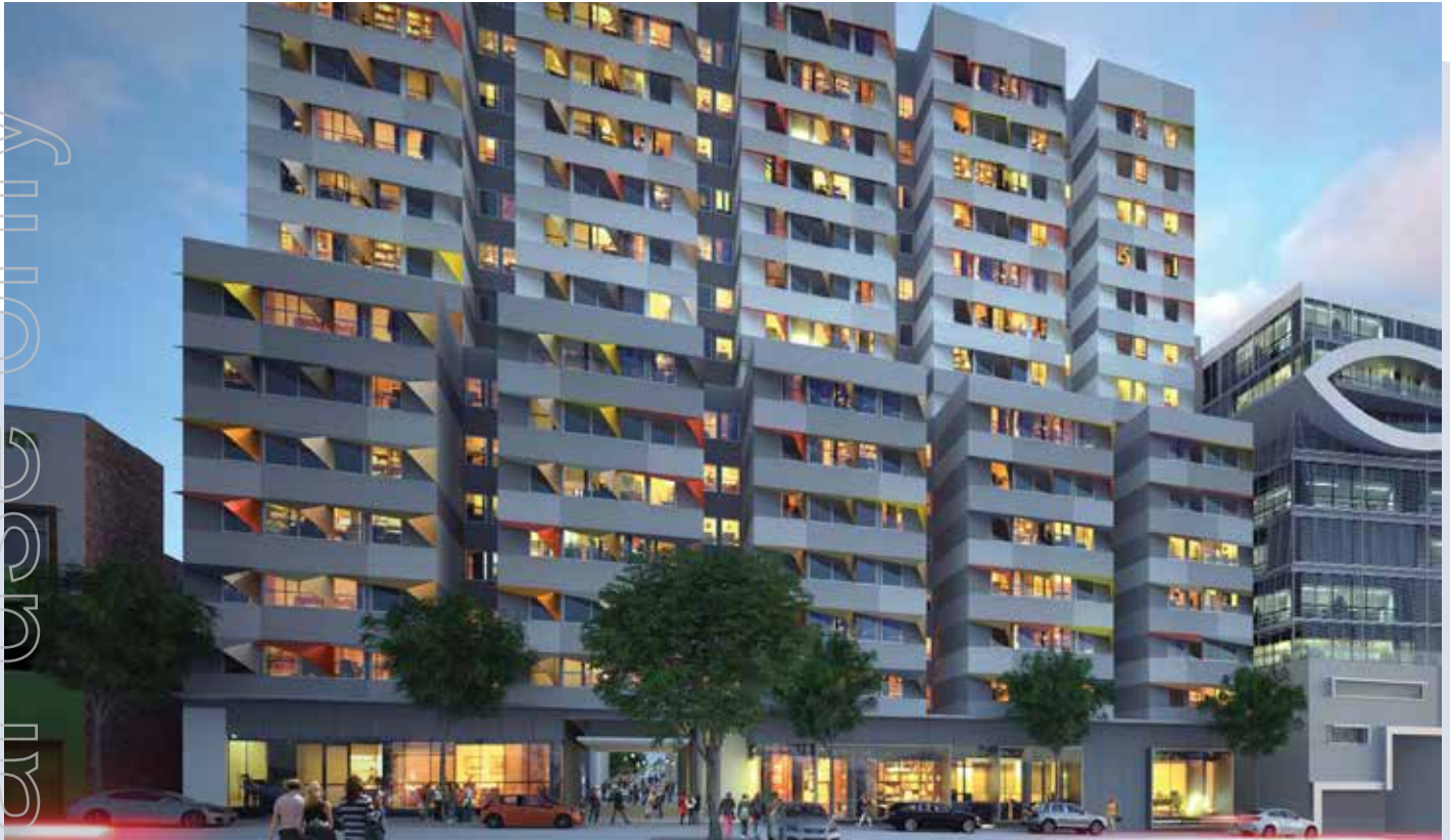
Leicester Street Student Accommodation