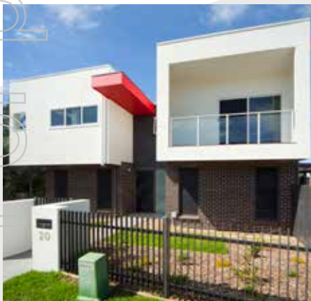
AE2 residential community