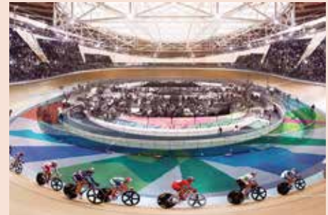
Queensland State Velodrome