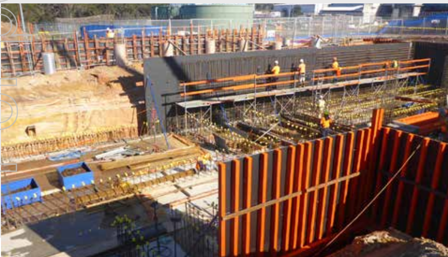
ANSTO Nuclear Medicine Molybdenum-99 Facility

Watpac commenced work on the Australian Nuclear Science and Technology Organisation (ANSTO) Nuclear Medicine Molybdenum-99 Facility in May 2014. The new multi-level 4,250 square metre facility at Lucas Heights will significantly increase ANSTO's capacity to produce the radioisotope molybdenum-99 – an active pharmaceutical ingredient used in more than 45 million nuclear medicine diagnostic procedures each year worldwide. Structural work has commenced on site including the use of a high density concrete using aggregates specifically imported from overseas. Hot cells that will be installed at the facility are undergoing nuclear design and fabrication in the US.