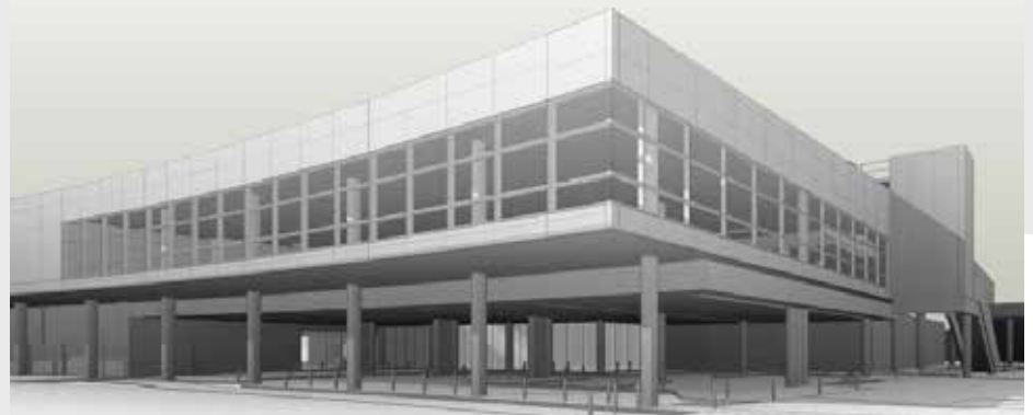
BAC Domestic Terminal Expansion

Watpac has been awarded the design and construction of Baiada's new protein plant in Tamworth. Watpac Specialty Services is working closely with Baiada's Danish equipment suppliers to design the new state-of-the-art-facility, which will feature both low and high temperature processing. This project is being fast tracked, with works commencing in April 2014 and scheduled for completion in April 2015.