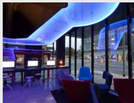
Ibis Adelaide Hotel

Works on the new premium economy Ibis Adelaide Hotel reached practical completion in June 2014. The hotel, located on Grenfell Street in the heart of the Adelaide CBD, was developed by Hines Property and is managed by global hotel group Accor following an extensive, worldwide operator