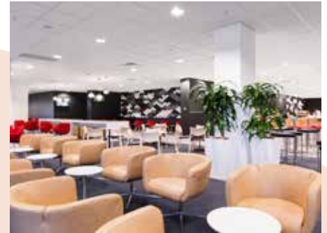
Darwin International Airport Expansion

Watpac is delivering a major upgrade of the Overseas Passenger Terminal at Circular Quay in Sydney. The main scope of works includes extending and refurbishing the ground floor to increase passenger capacity and improving access via road upgrades, a new taxi drop off area and the installation of new internal and external lifts. The upgrade will also deliver a new mezzanine floor to increase the Terminal's internal seating capacity and an extension to the south forecourt to provide additional covered seating areas. Construction is well advanced with works taking place in a live and operational passenger terminal. Site activities have continued 24 hours a day seven days a week since September in order to accelerate the works, which will be progressively handed over from late December 2014.