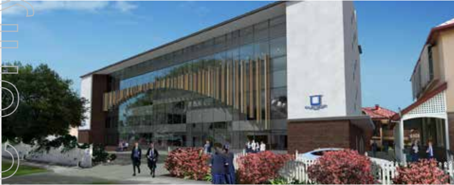
Brisbane Girls Grammar School Year 7 and Research Centre