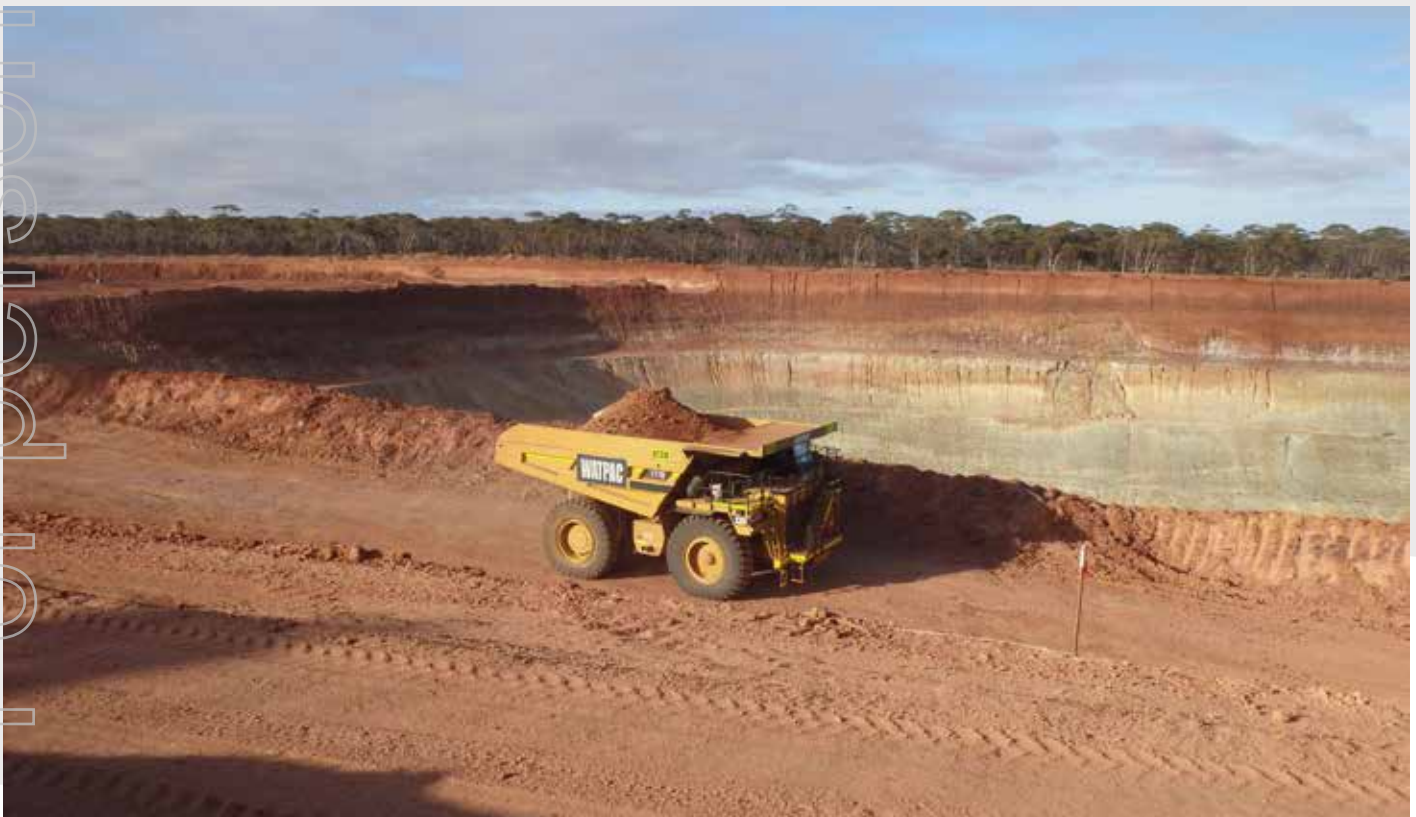
Hanking Gold Mining

Pluton Resources' iron ore mine at Cockatoo Island is located off the coast of northern Western Australia. Works on the initial two-year agreement commenced in November 2012, including the commissioning of a new crushing and screening facility. Watpac is responsible for all operational mining and civil infrastructure services to the iron ore project, including drill and blast, loading, haulage and processing of ore for direct shipping. Watpac also has responsibility for managing all other aspects of working in a remote location including camp, air travel and barge deliveries on and off the island. Significant milestones include the commencement and soon to be completed section of the stage 4 sea wall, which will allow Watpac to access parts of the ore body previously out of reach.