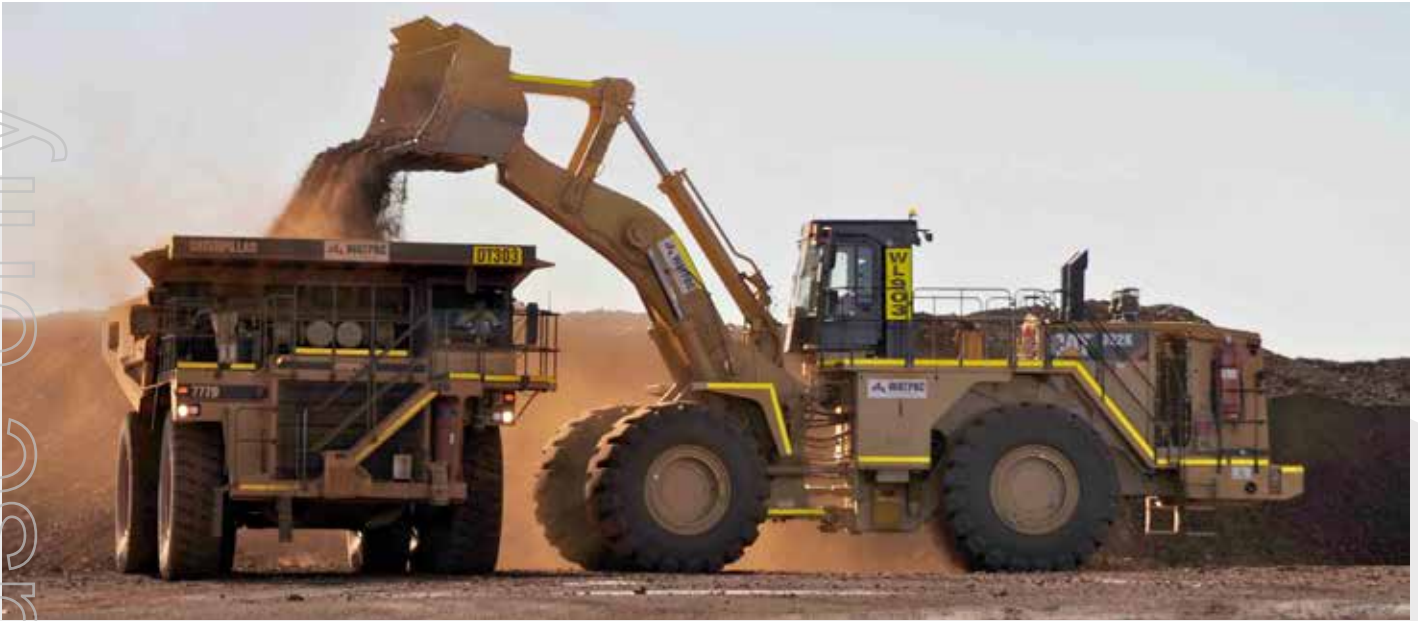
Nullagine Iron Ore Project