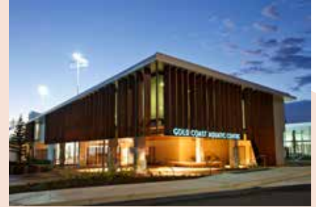
Gold Coast Aquatic Centre

Watpac has been awarded Stage 1 managing contractor services for construction of the Queensland State Velodrome in Brisbane for the Gold Coast 2018 Commonwealth Games. This is the second project Watpac is undertaking for this international event. The $55M velodrome will include a world-class timber track, streamlined roof design, mixed use sports courts, function spaces and a café. Construction commenced in November 2014 with works expected to be completed by mid-2016.