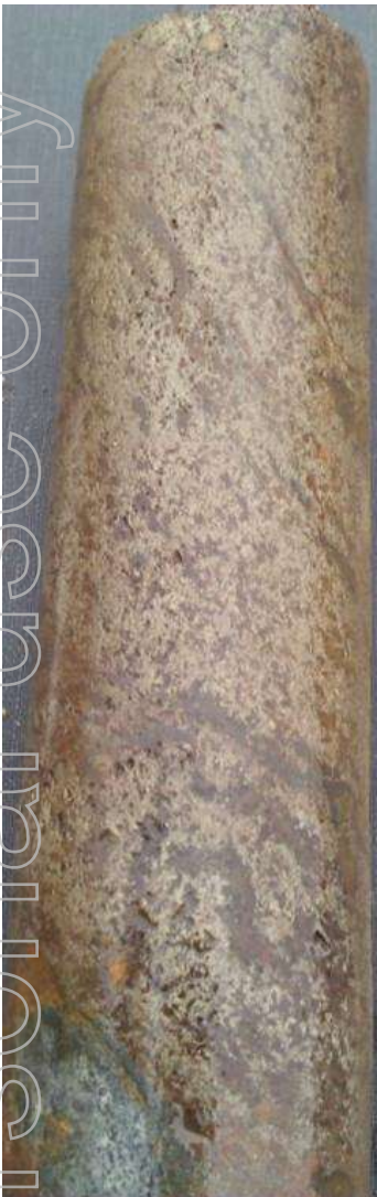
Figure 2. Massive sulphide with nickel and copper from 58 m

The newly discovered mineralisation in RHD006, which includes a 0.5 m wide zone of massive sulphide with nickel and copper sulphides (Figure 2) occurs above the recently reported high-grade copper-nickel-platinum group element (PGE) mineralisation from RHD001 that returned an intercept of: