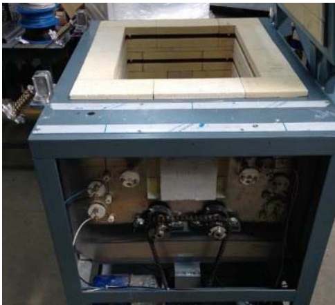
Batch kiln being built

The identified benefits of purchasing the Mt Garnet Mill by SPM and subsequently by CSD, is the ability to convert the operating mill to tin processing. CSD has identified this as a medium term initiative that will have multiple benefits, the main being that it is ideally located in close proximity to the Mt Garnet Tin Project. The company has identified and realised the opportunity to become a base metal producer as a first step. As a result of becoming a base metal producer, the company will be focused on maintaining a positive cash flow from this production. The company intends to progressively diversify into tin production. The initial tin project production target will be scaled down, at this stage, from 1mtpa to approximately 300 ktpa throughput (approximately 2,000 tonnes of tin metal in concentrate pa). This will reduce initial capex and also allow for the continued utilisation of the poly metallic circuit for base metal production. In addition this will allow the company to utilise the latent comminution capacity for the tin project which will further reduce initial capex. The Mt Garnet Tin Project Definitive Feasibility Project (DFS) is on schedule for completion by mid-2015, with targeted tin production estimated for early 2016. DFS testwork is continuing. The company has now established a lab scale roasting facility at Mt Garnet. Pilot scale testwork is scheduled to be completed by June 2015.