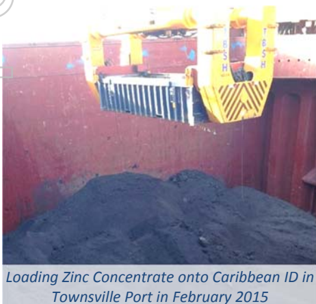
Loading Zinc Concentrate onto Caribbean ID in Townsville Port in February 2015

SPM has a concentrate offtake agreement with MRI Trading which will transfer to CSD in due course. The concentrate is transported to Townsville Port by road train and shipped offshore. Prepayment of concentrate is made on delivery to a bonded warehouse at Townsville Port. Concentrate transport from Mt Garnet to Townsville is continuous and concentrate prepayment is made on a regular basis to meet operational expenditure.