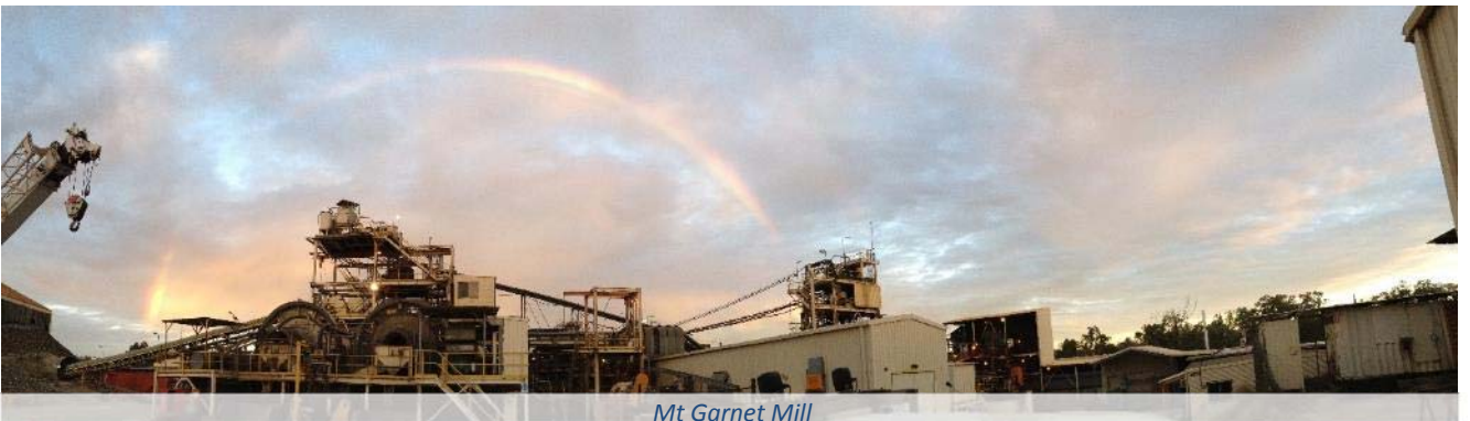
Mt Garnet Mill

The Mt Garnet concentrator continued operating seamlessly post transfer from SPM to CSD. The concentrator continues operating 24/7 producing approximately 2,500 tonnes of zinc metal in concentrate, 700 tonnes of lead metal in concentrate and 180 tonnes of copper metal in concentrate per month. The Mt Garnet concentrator currently has 39 staff and is located adjacent to the town of Mt Garnet which has all the modern facilities and infrastructure expected in a small town. Many of the staff reside locally and the company leases a number of houses in the town for staff accommodation.