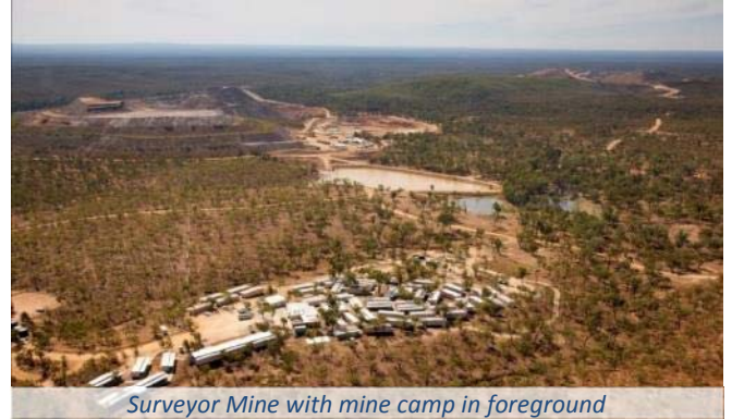
Surveyor Mine with mine camp in foreground

SPM operations transitioned seamlessly to CSD on 13 January 2015. Surveyor Mine continues to be a 24/7 operation, mining approximately 30,000 tonnes per month of poly metallic ore. The ore is trucked continually to Mt Garnet by road train. Surveyor Mine currently has 50 staff, and is a drive in/drive out site with a full camp and catering facilities.